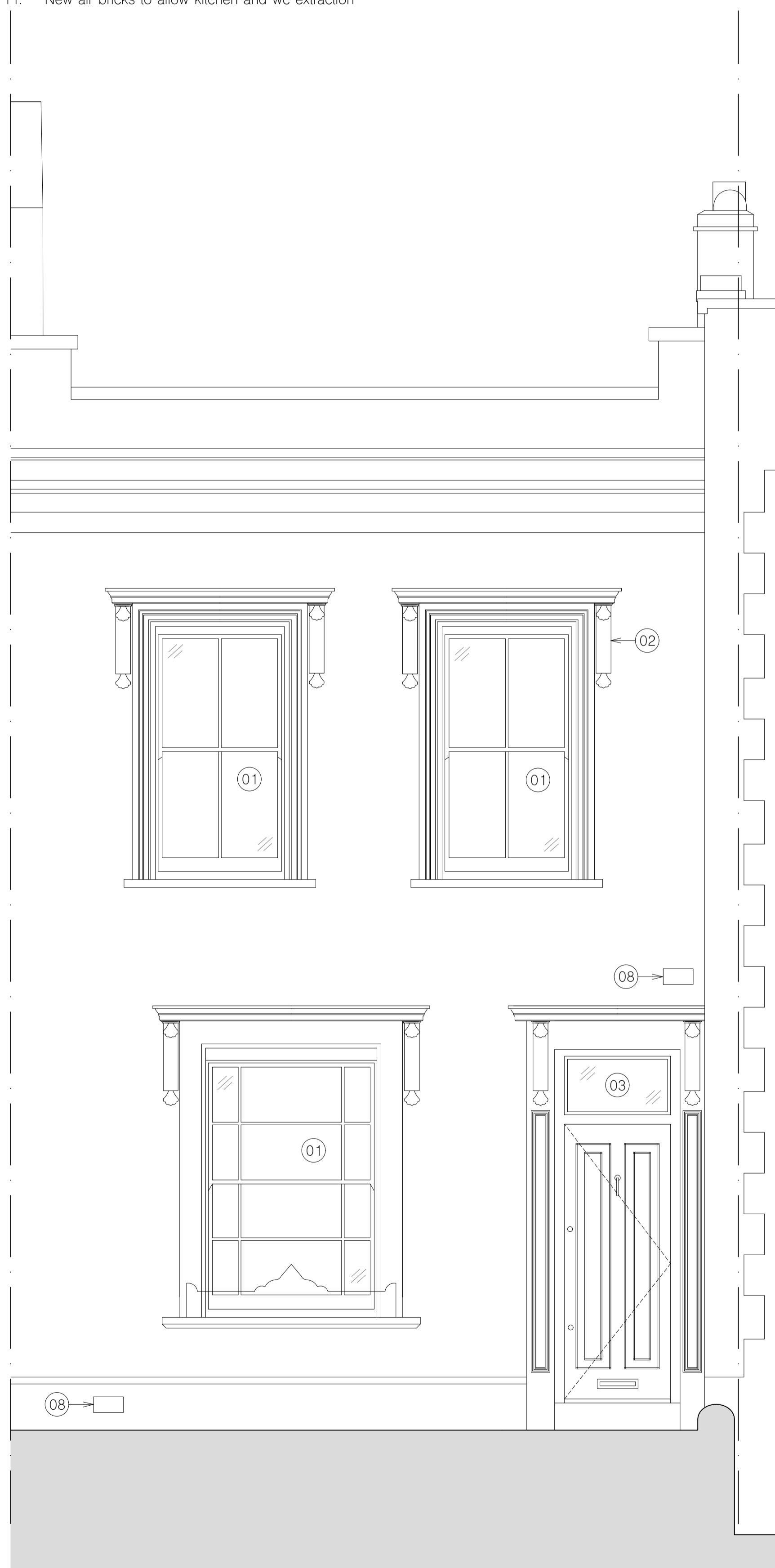
1 existing front elevation