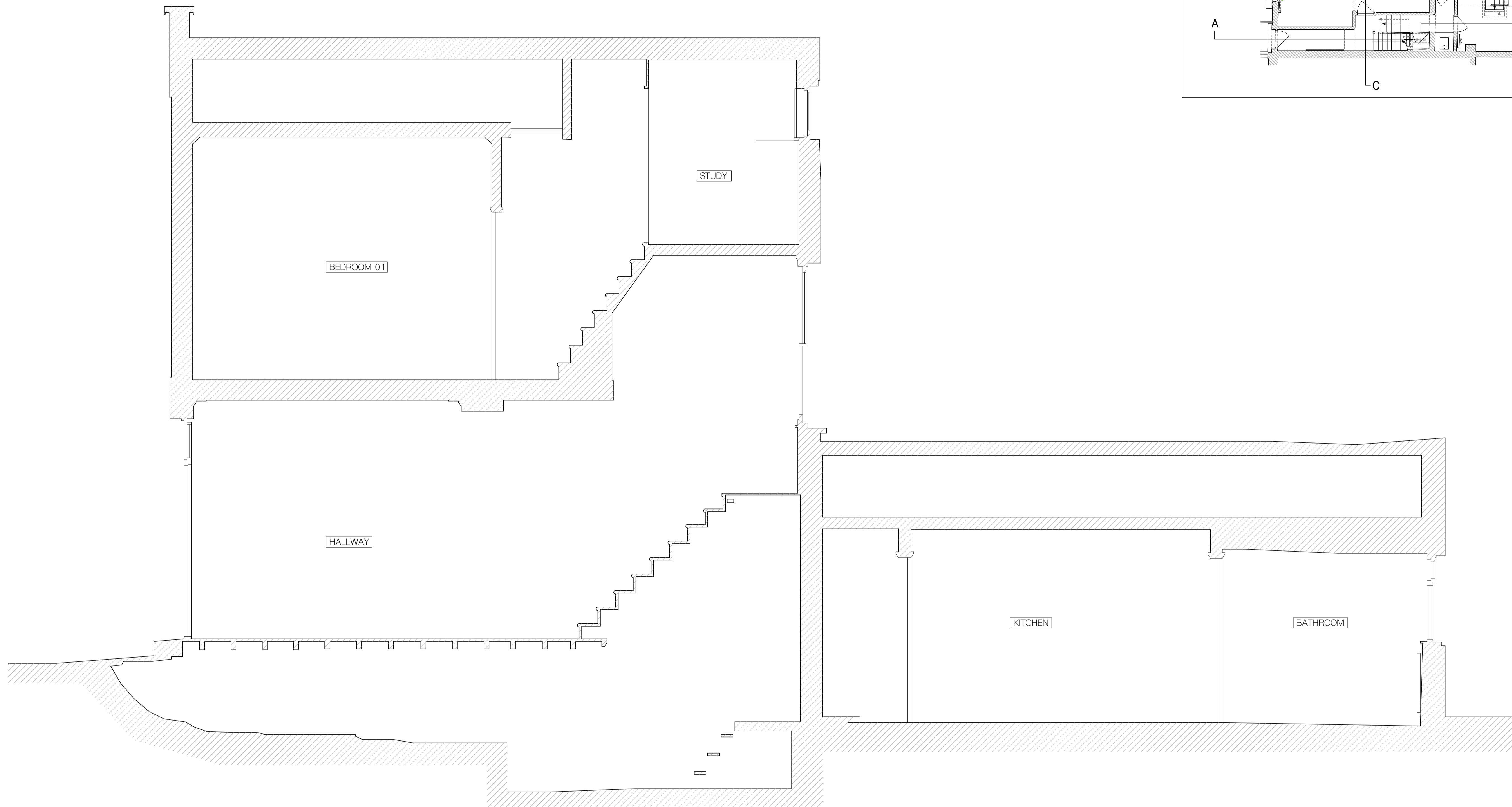
1 existing section AA