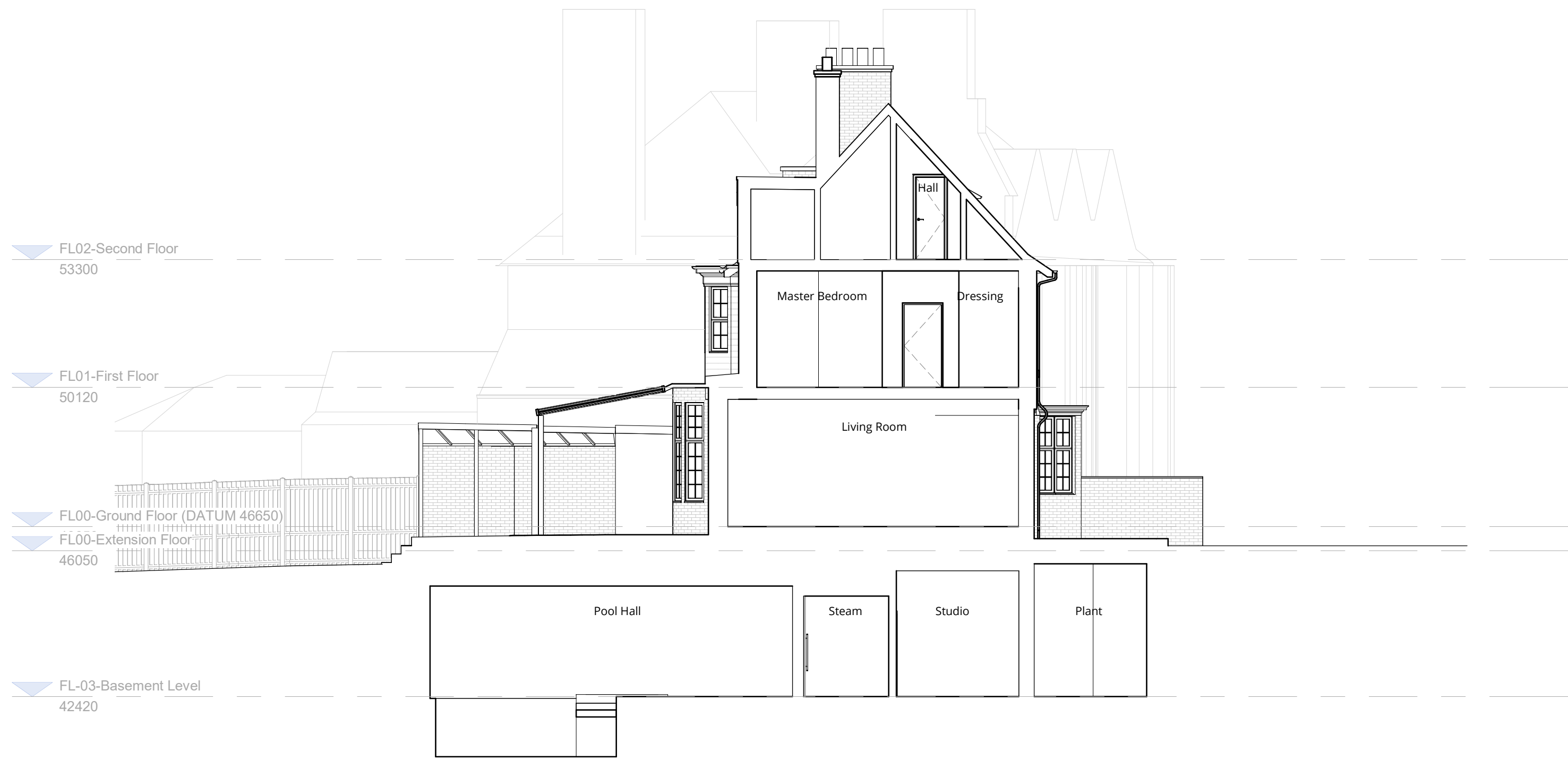
Proposed Section D-D 1 : 100