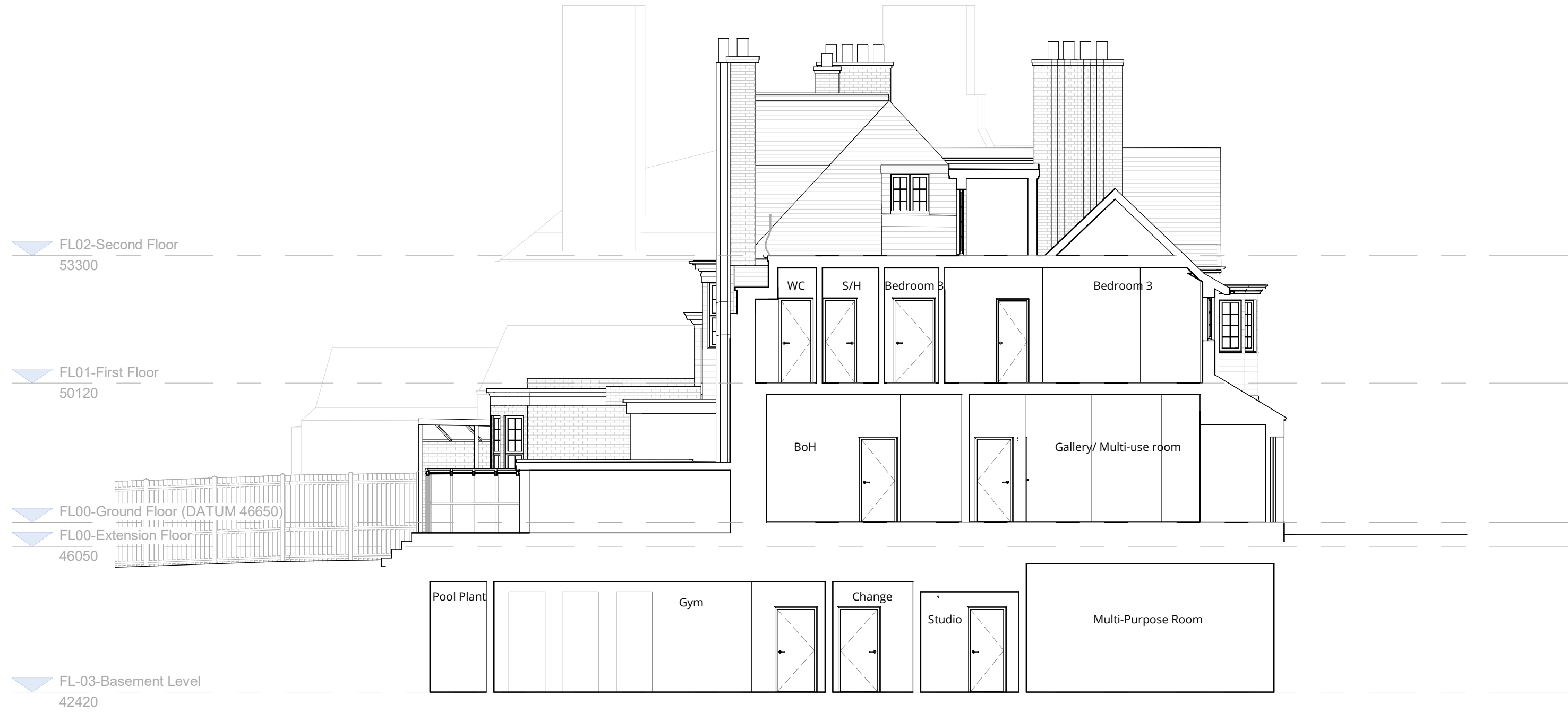
Proposed Section C-C 1 : 100