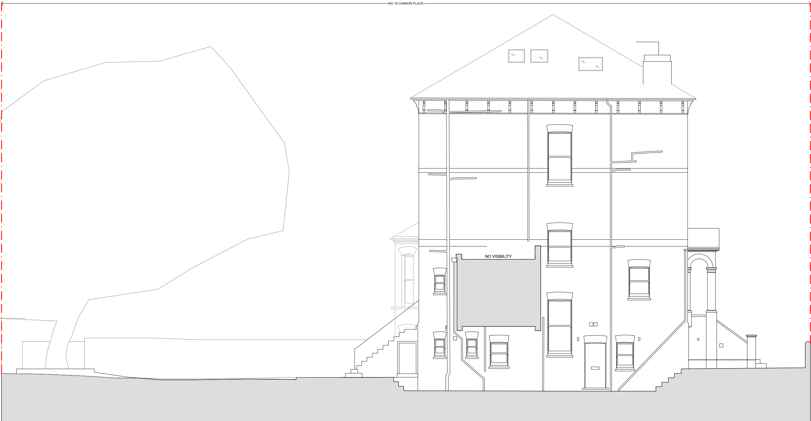
1 Existing Side Elevation Scale: 1:100