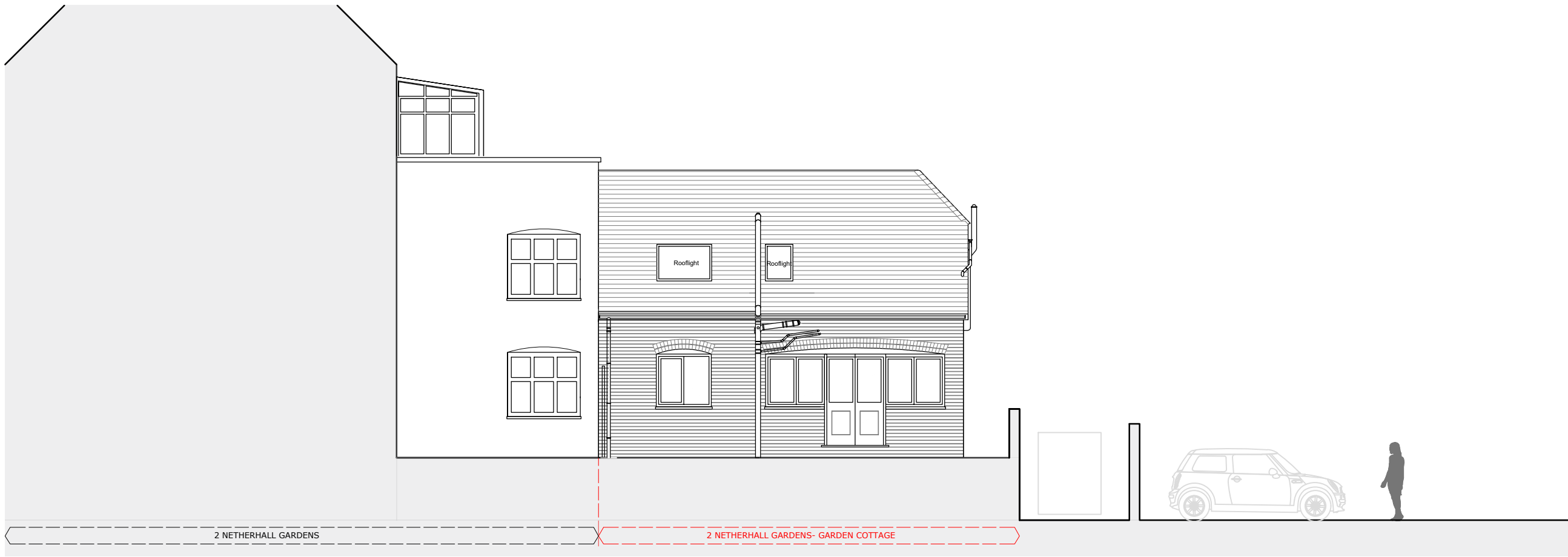
SOUTH WEST ELEVATION (REAR)