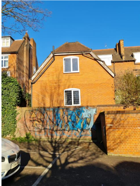
Photo A: External – 2 Netherhall Gardens, Garden Cottage Side elevation

66 Bickenhall Mansions Bickenhall Street London W1U 6BX t: +44(0)207 486 6675 e: info@mdclondon.com w: www.mdclondon.com