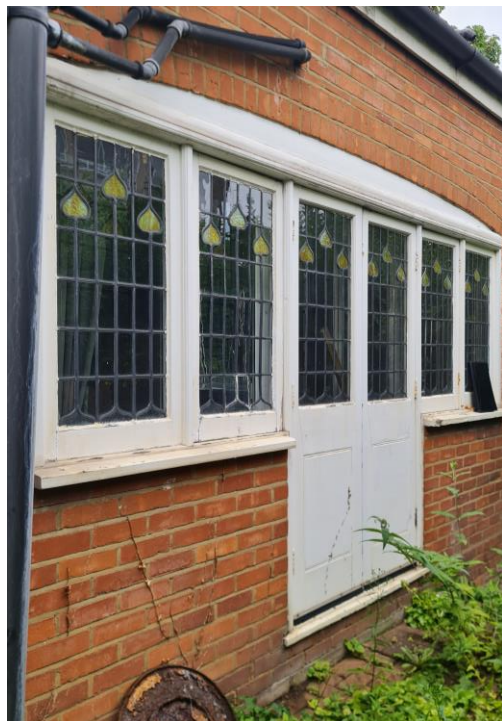
Photo G: External – Garden Cottage Rear double doors to Rear Garden