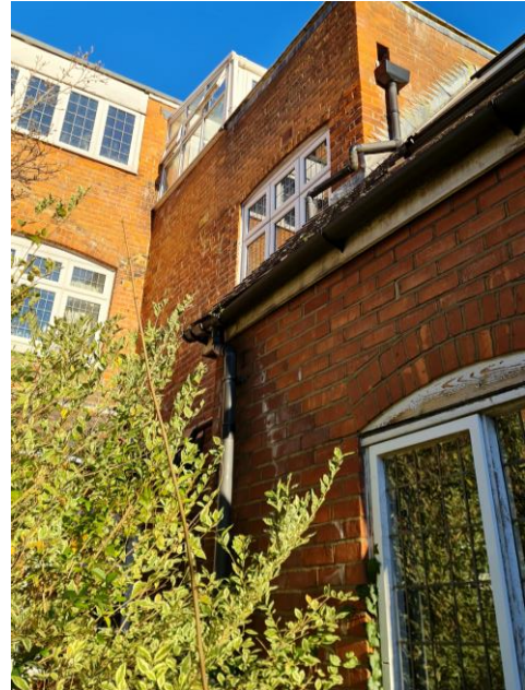
Photo B: External – 2 Netherhall Gardens Garden Cottage Rear Elevation