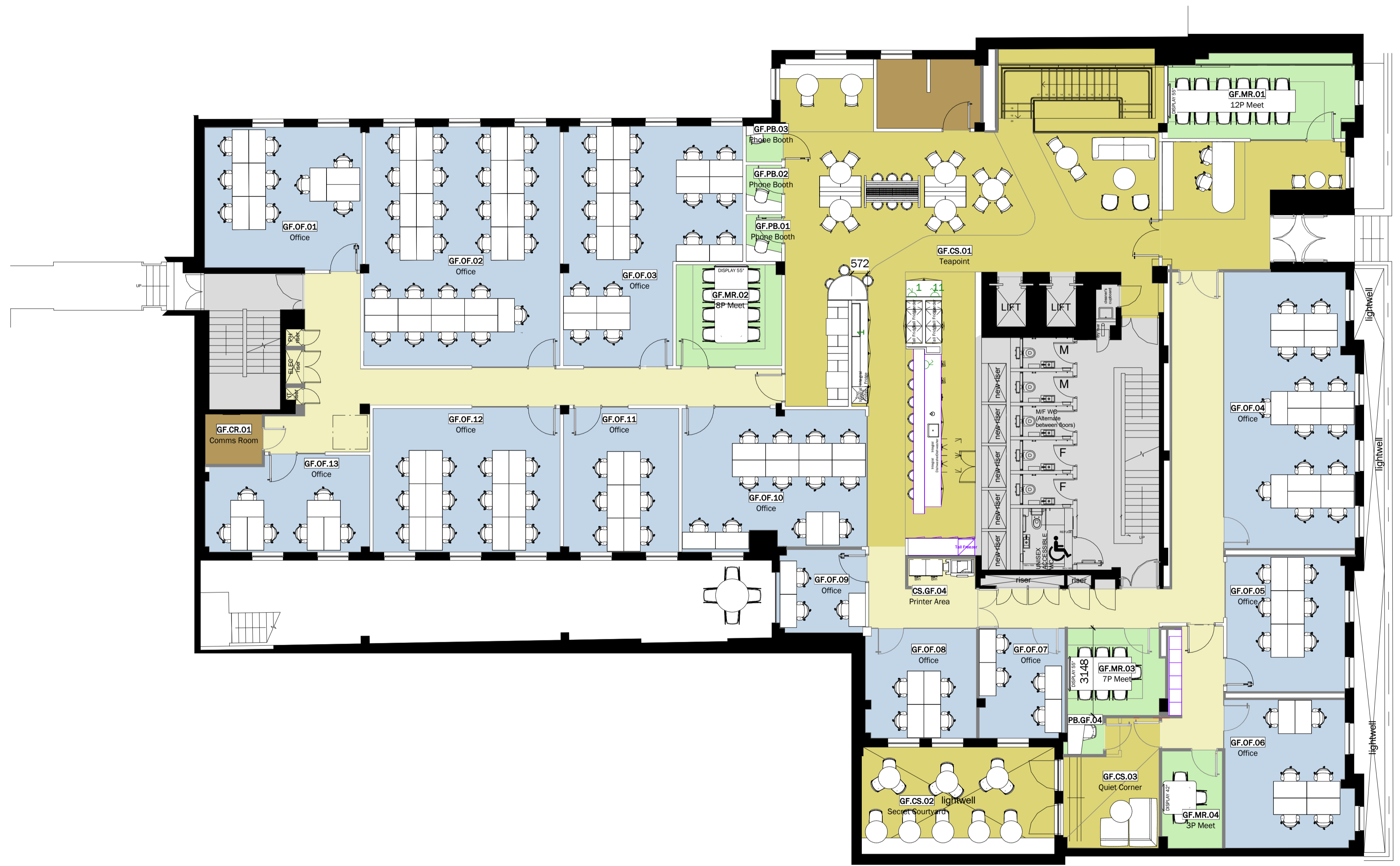
1 General Arrangement - Ground Floor Existing 1 : 100