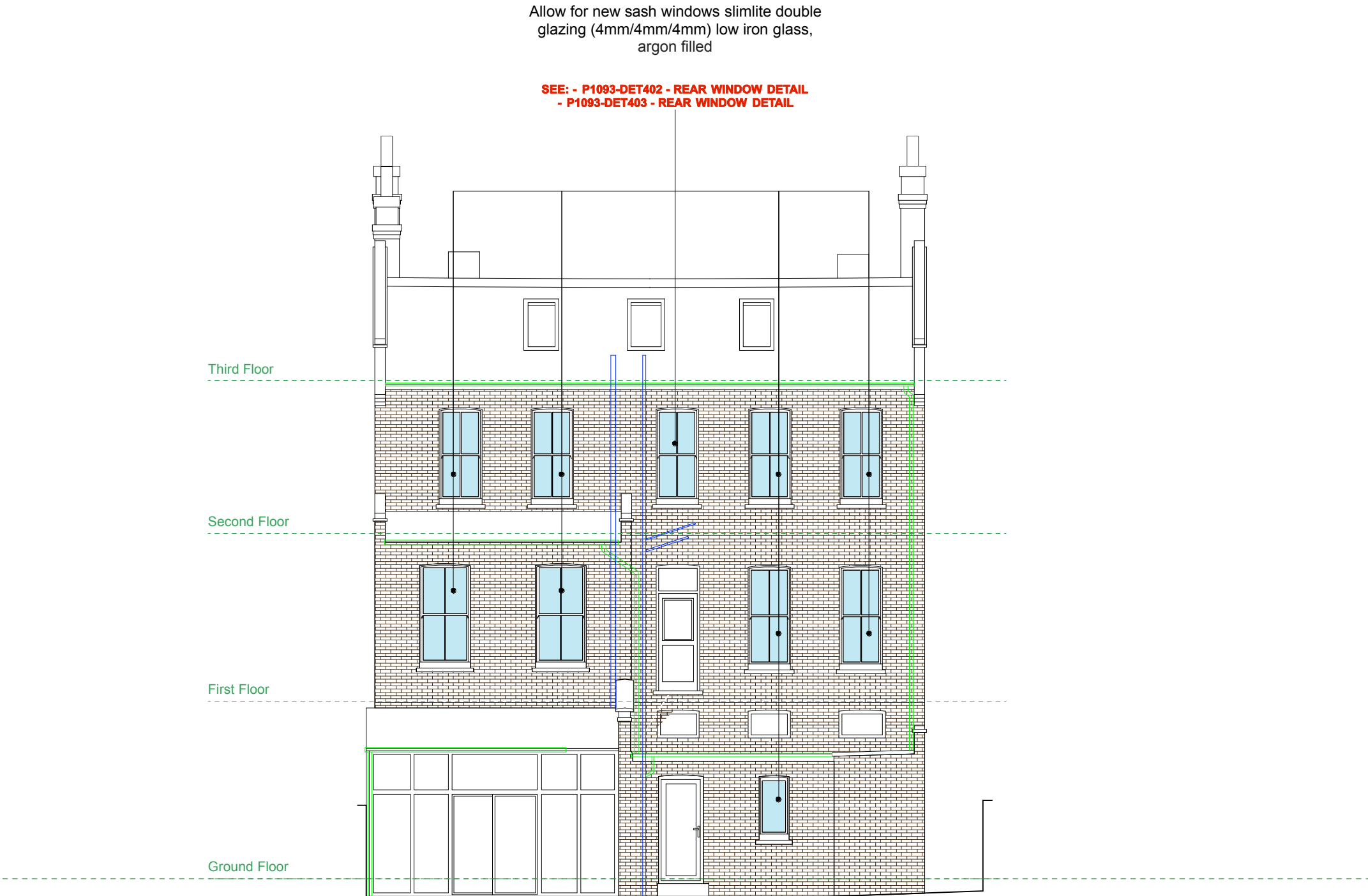
08 REAR ELEVATION Scale: 1:100

COPYRIGHT AND LIABILITY NOTES: The design and drawings remain the property of Peek Architecture + Design. The client for this project will be licensed to use this design and documents on this site only upon full payment of architectural fees. This license is non-transferable. The design and drawings shall not be reproduced, up-loaded to the internet or traced without the permission of Peek Architecture + Design. This drawing has been prepared from a survey drawing from Peek Architecture and Design Ltd commissioned by the client. It is VERY IMPORTANT that all dimensions are checked carefully before any work commences or any materials are ordered. If any discrepancies are noticed between this drawing and any other contract document then please contact Peek Architecture + Design immediately. DO NOT SCALE USE FIGURED DIMENSIONS ONLY All dimensions to be verified on site prior to the commencement of any work or the production of any shop drawing. This drawing to be read in conjunction with all related Architect's and Engineer's drawings and any other relevant information. GENERAL NOTES: