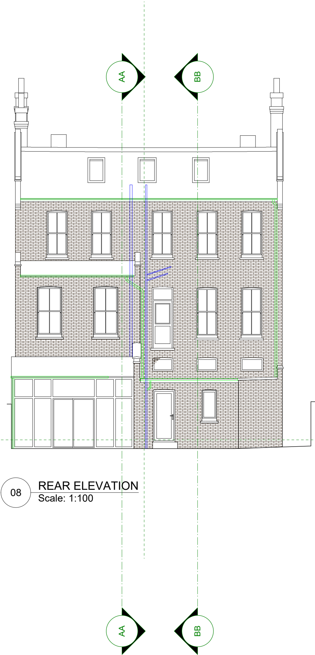
08 REAR ELEVATION Scale: 1:100

COPYRIGHT AND LIABILITY NOTES: The design and drawings remain the property of Peek Architecture + Design. The client for this project will be licensed to use this design and documents on this site only upon full payment of architectural fees. This license is non-transferable. The design and drawings shall not be reproduced, up-loaded to the internet or traced without the permission of Peek Architecture + Design. This drawing has been prepared from a survey drawing from Peek Architecture and Design Ltd commissioned by the client. It is VERY IMPORTANT that all dimensions are checked carefully before any work commences or any materials are ordered. If any discrepancies are noticed between this drawing and any other contract document then please contact Peek Architecture + Design immediately. DO NOT SCALE USE FIGURED DIMENSIONS ONLY All dimensions to be verified on site prior to the commencement of any work or the production of any shop drawing. This drawing to be read in conjunction with all related Architect's and Engineer's drawings and any other relevant information. GENERAL NOTES: