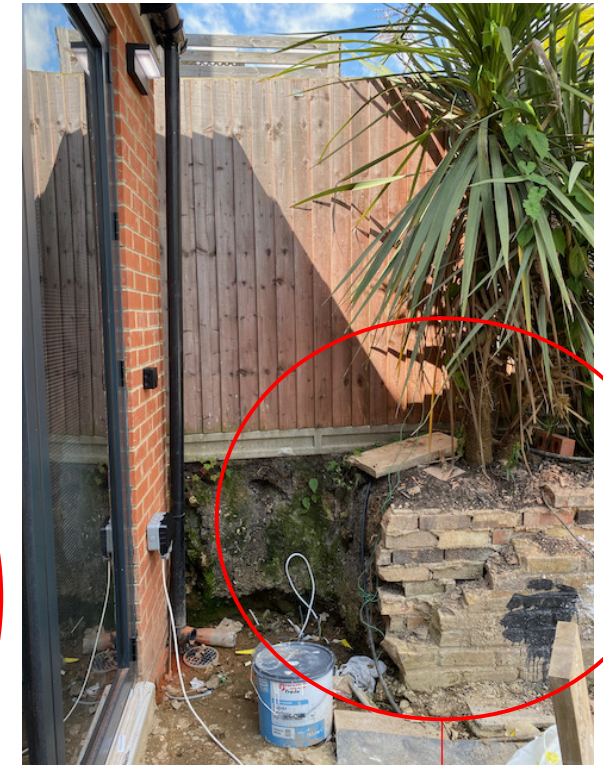
Area where new condensing unit in acoustic housing is to be installed