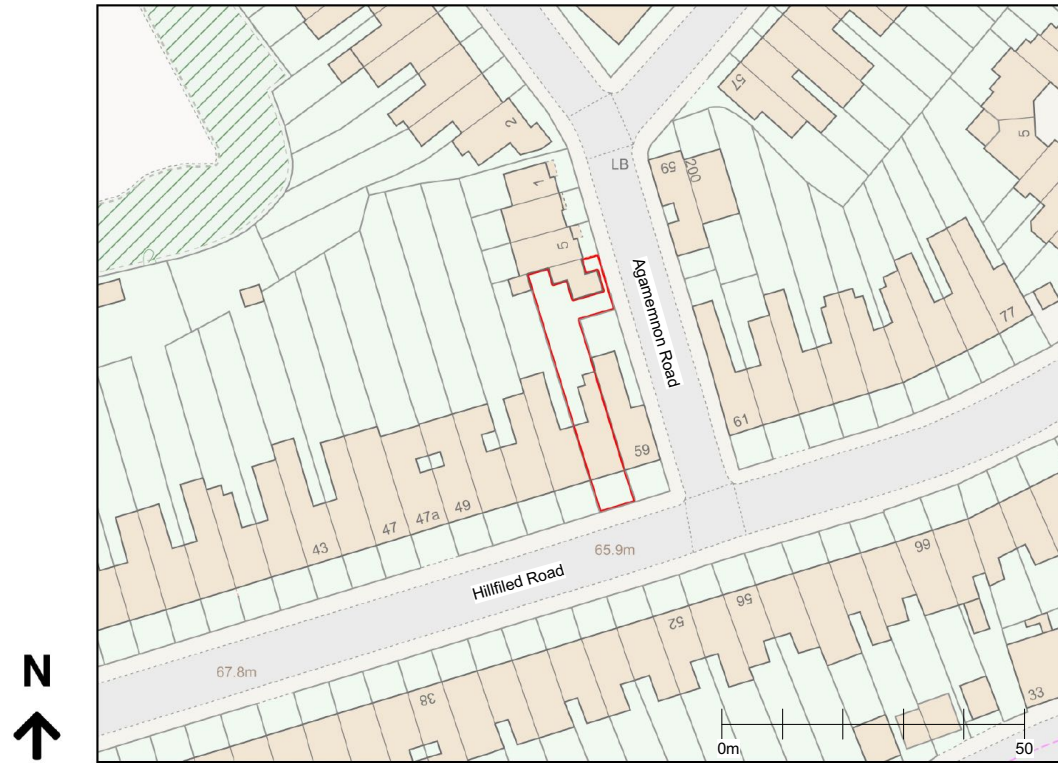
Location Plan 1:1250 57 Hillfield Road