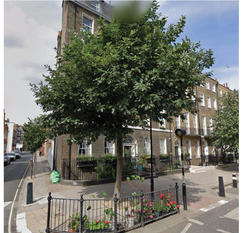
Appearance on John Street (corner John Street No 28 & 12 Northington Street)