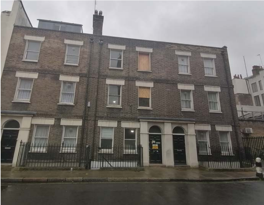
Appearance on Northington Street