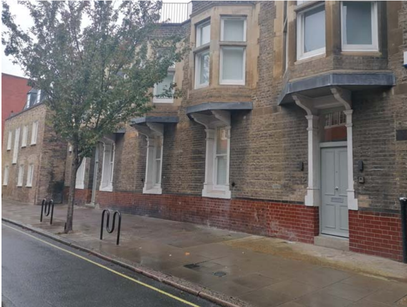
Front elevation 14, 12 Northington Street and 28 John Street