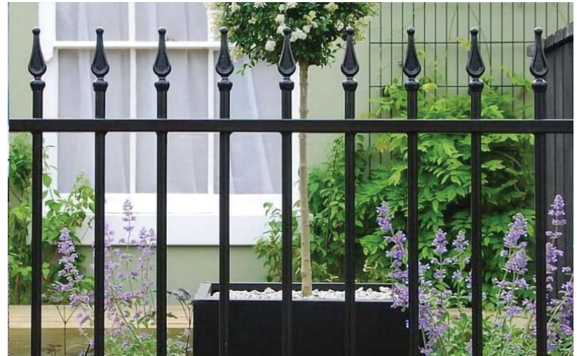
Proposed Metal Railing