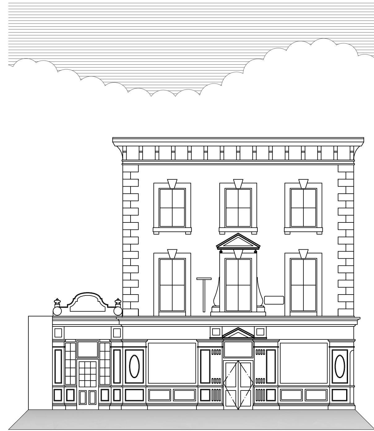
EXISTING PRINCIPAL ELEVATION Scale 1:100

General Notes The contents of this drawing are copyright to RTSAN and may not be altered, copied or reproduced without written consent. Contractor must verify all dimensions and report any discrepancies before putting work in hand. Drawings for PLANNING purpose only and hence do not scale from this drawing.