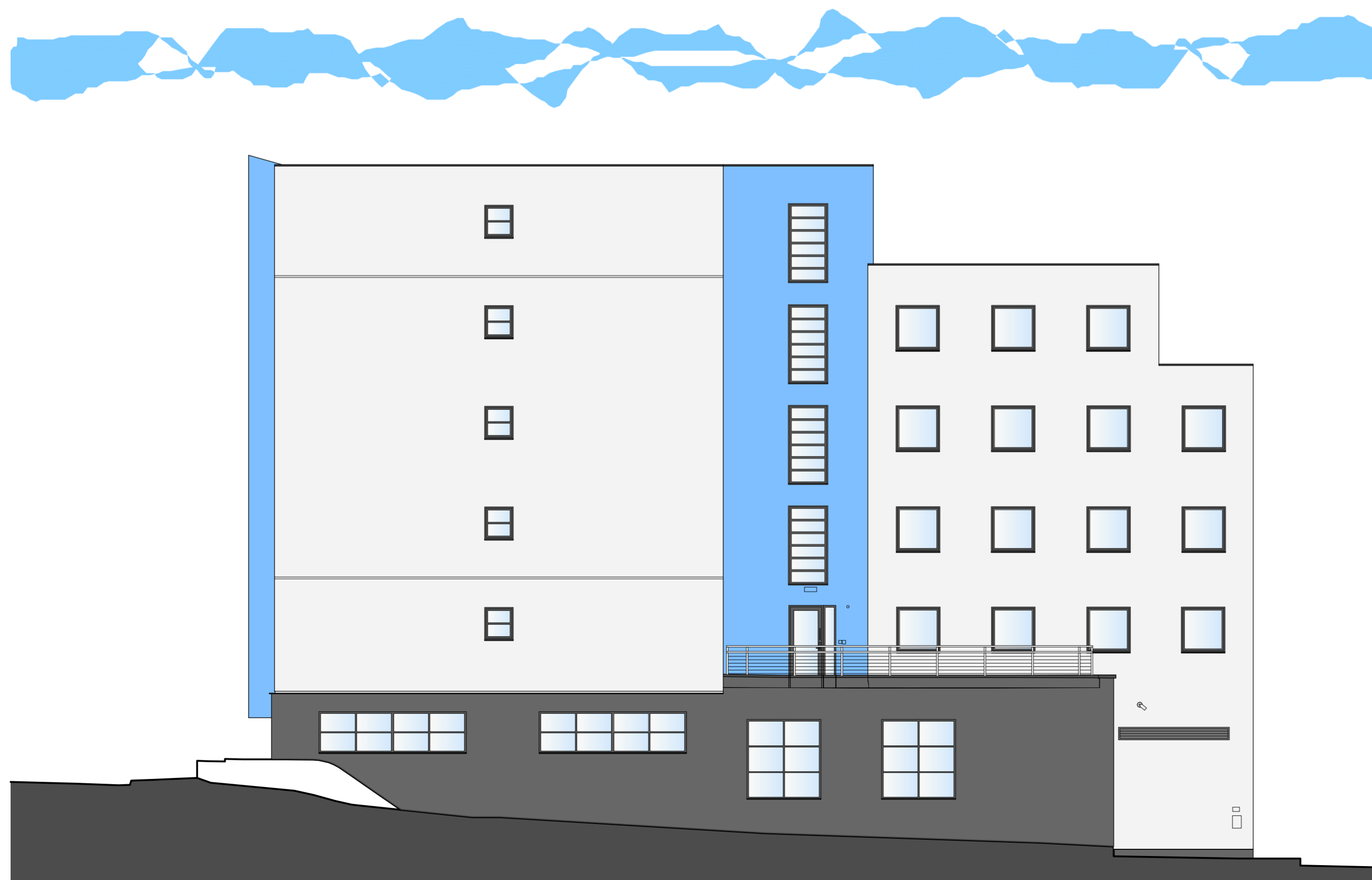
2 - SIDE ELEVATION. Elevation E6.

This drawing is the copyright of Axiom Architects. It is for planning application purposes only and may not be reproduced in whole or in part without permission. Drawings lodged for planning approval may be reproduced by the Planning Authority in accordance with the "Copyright (Material Open to Public Inspection) (Marking of Copies of Plans and Drawings) Order 1997" and must carry the relevant copyright restriction note. Scaling from this drawing should only be carried out from a print at the scale and size specified within the title block. Responsibility for ensuring correct size reproduction remains with the reader.