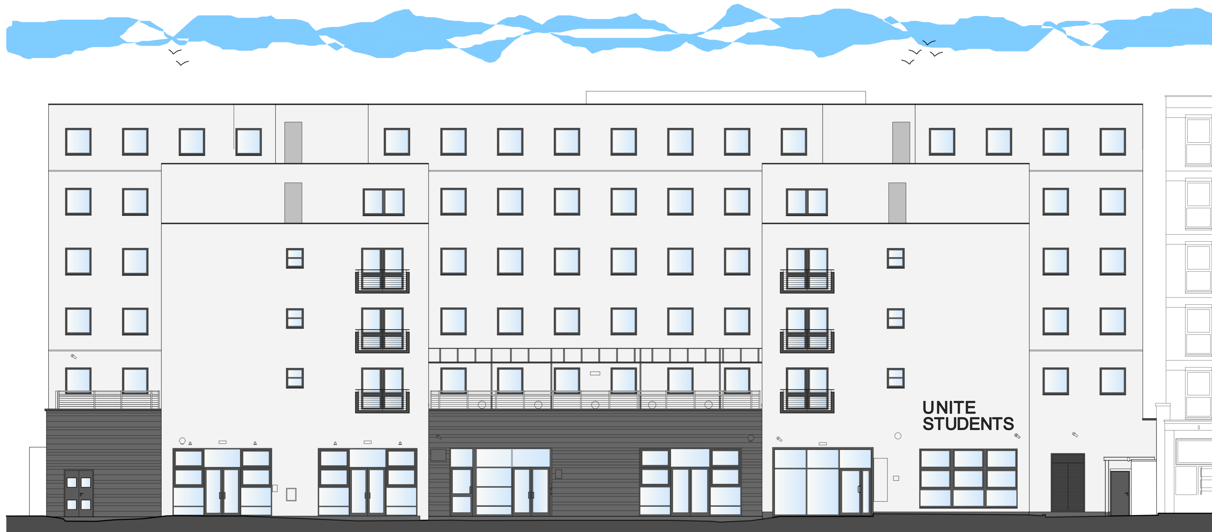
1 - FRONT ELEVATION - Holmes Road. Elevation E4.