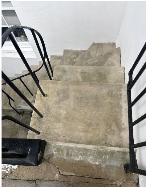
No. 8 Rothwell Street Basement steps overlaid with York Stone