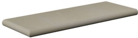
Specification York Stone supplies - 30mm Hebden York stone to existing treads with bullnose to front edge of tread