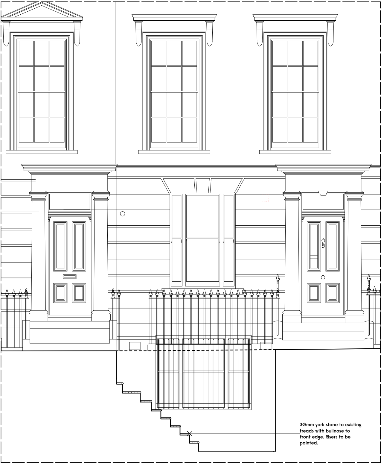
2 Proposed Front Elevation 1:50 @ A3