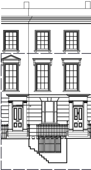
3 Elevation Key 1:200 @ A3