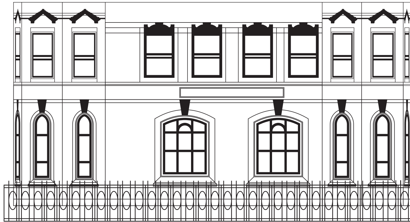
EXISTING ELEVATION (BLOOMSBURY ST) SCALE 1:80 @A3