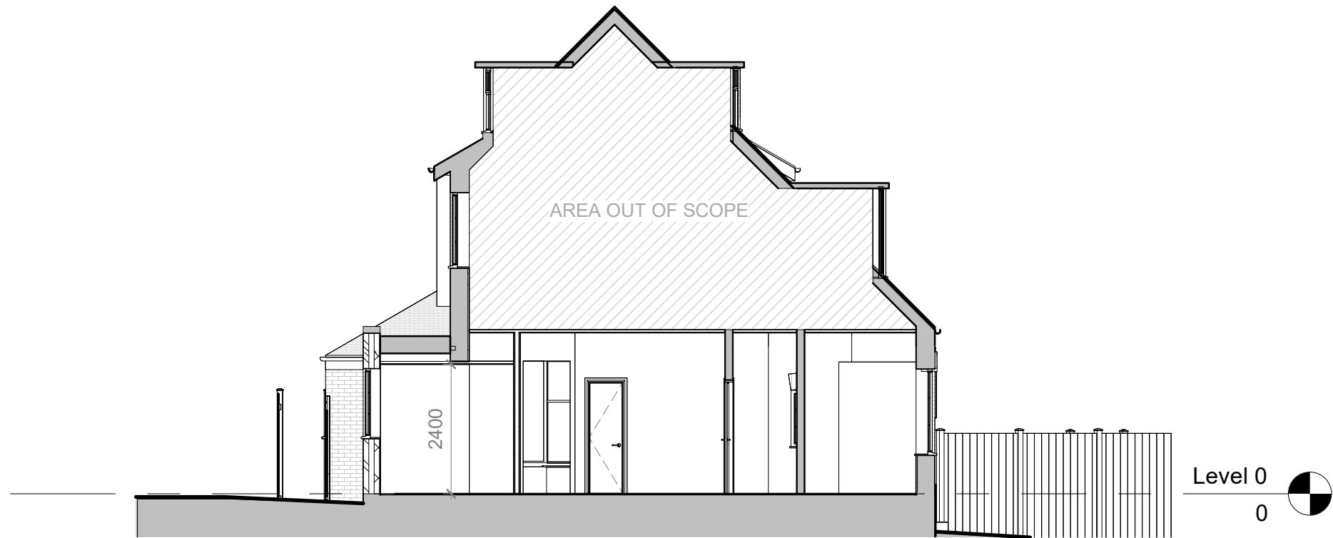
1 S101 Section 1 1 : 100