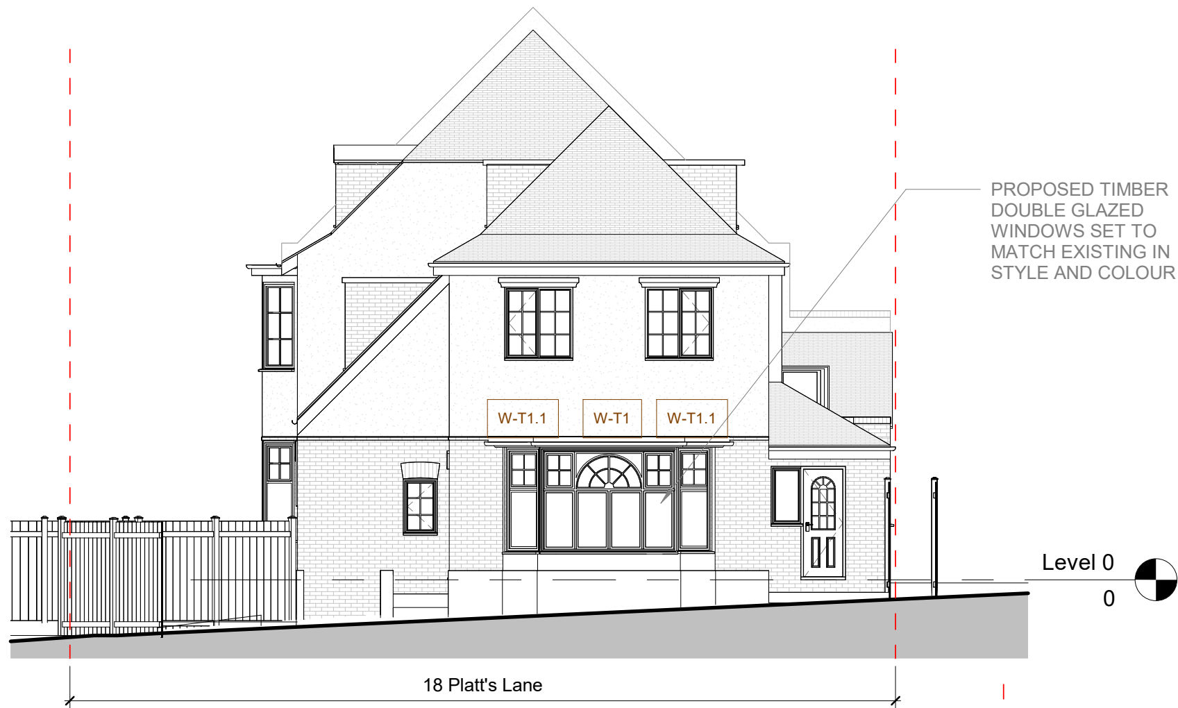
1 E102 SIDE ELEVATION 1 1 : 100