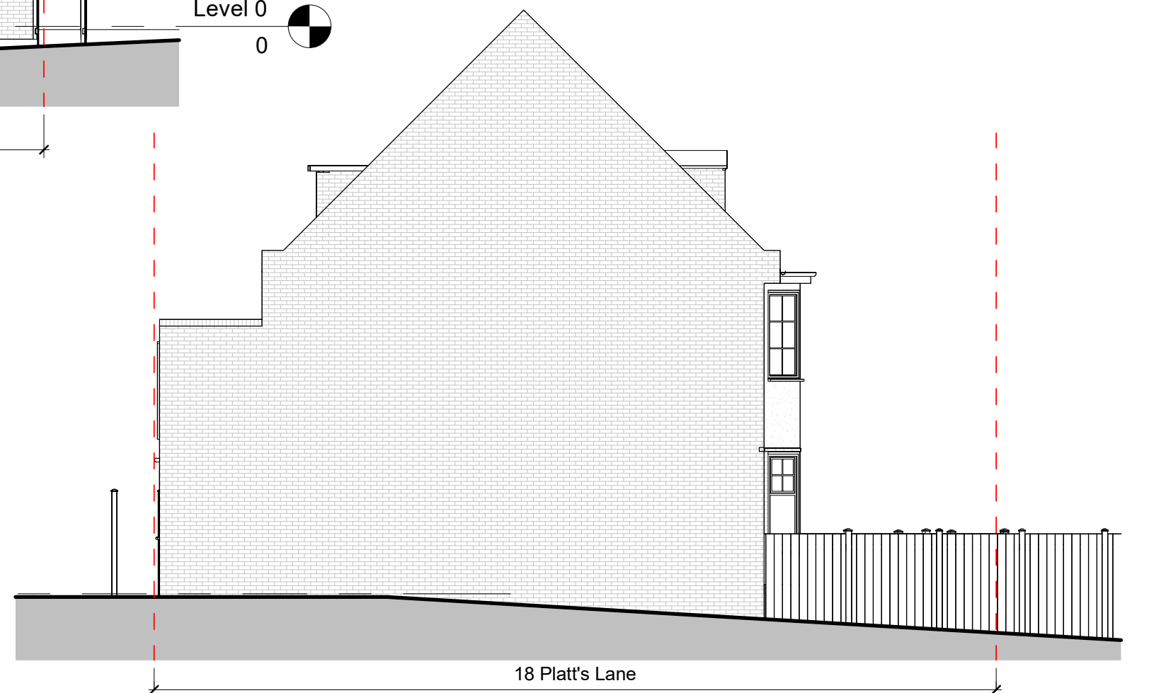
2 E102 SIDE ELEVATION 2 1 : 100