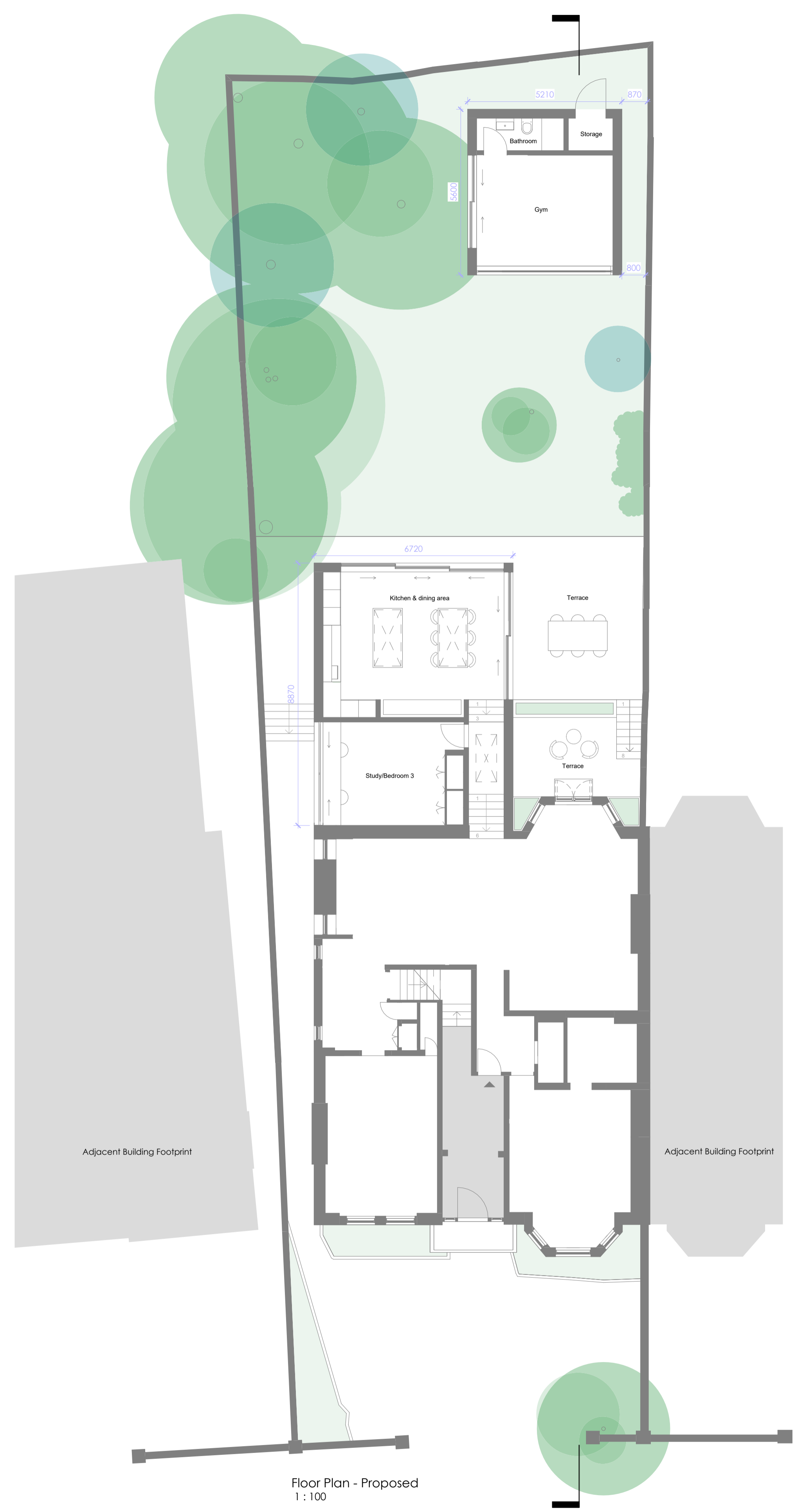
Floor Plan - Proposed 1:100