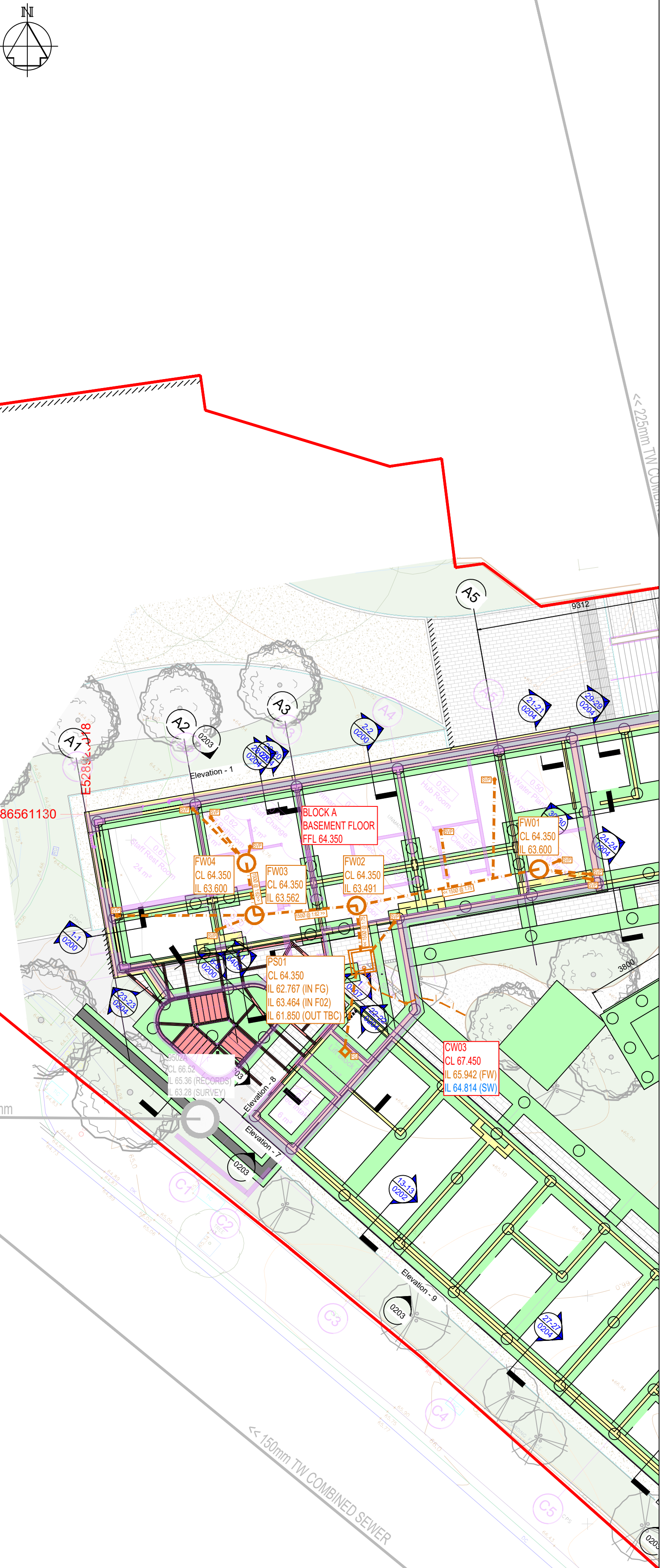
BASEMENT FLOOR LAYOUT SCALE 1:100

PELL FRISCHMANN CH0011-PEF-CH-XX-SK-S-0004 Chester Road Below Ground Constraints