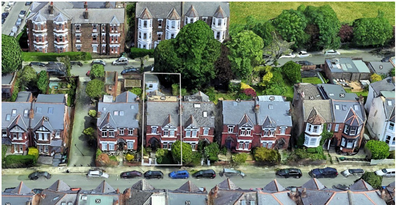
P-02 Aerial view