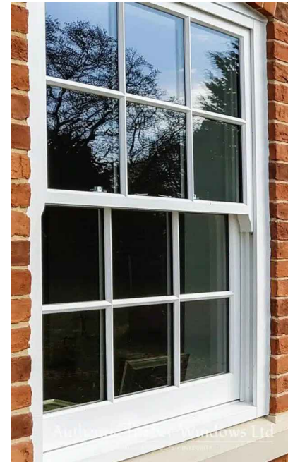
Timber sash window painted white