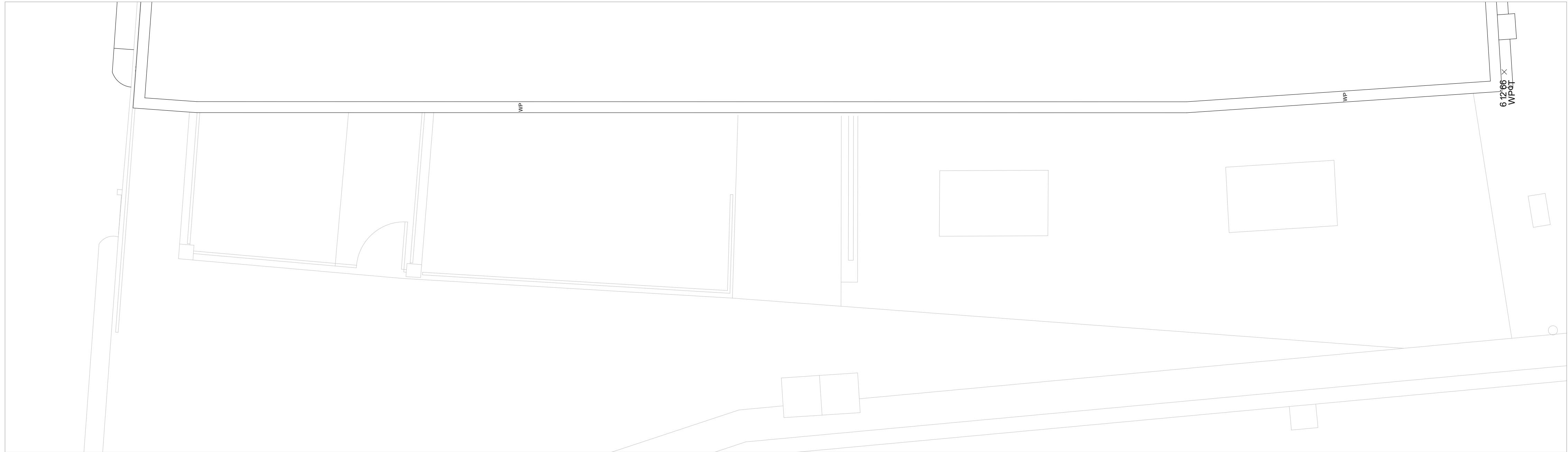
1 EXISTING EAST FACADE EXTERNAL PLAN 201 SCALE 1:50