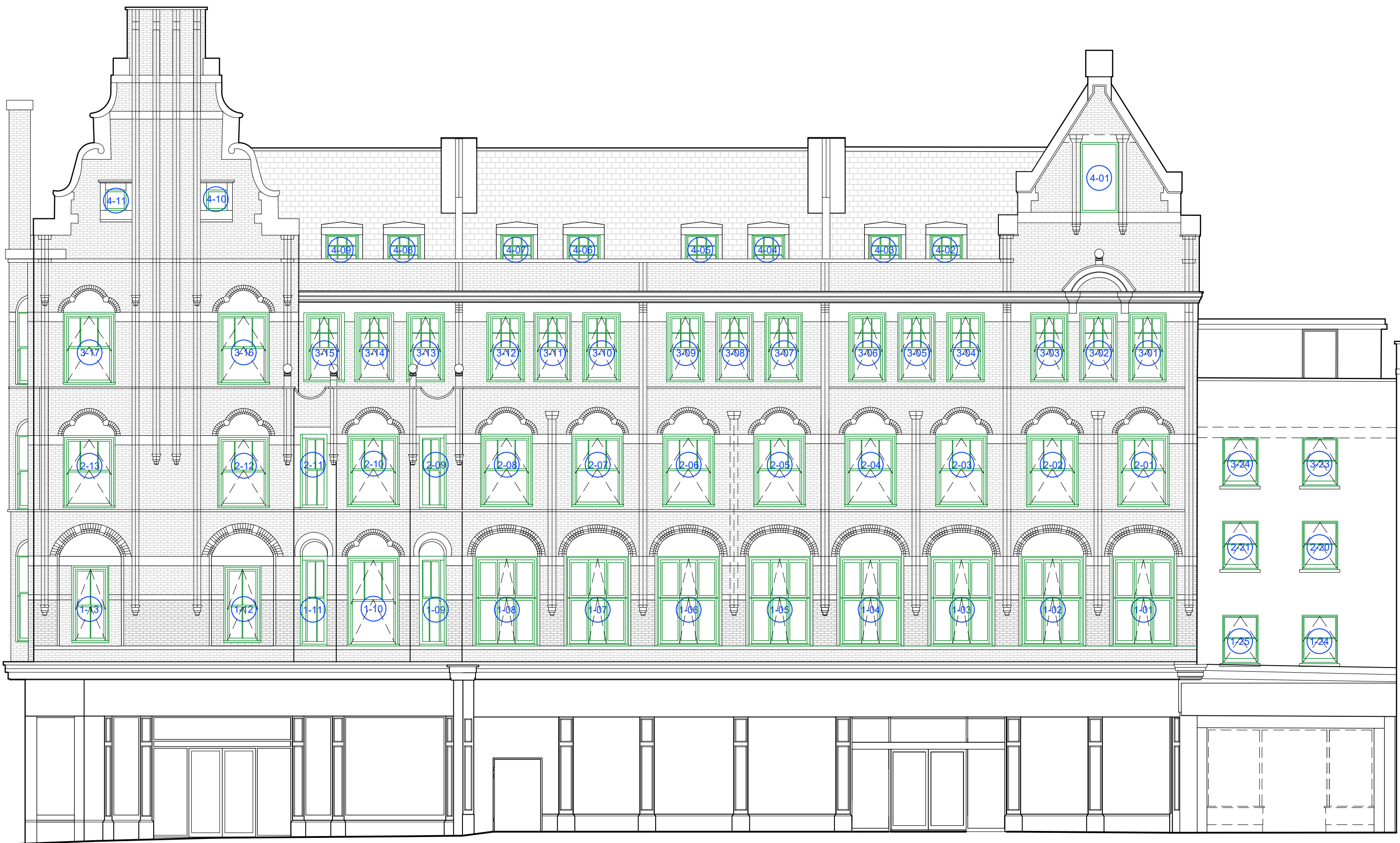
PROPOSED SOUTH-WEST ELEVATION 1:100