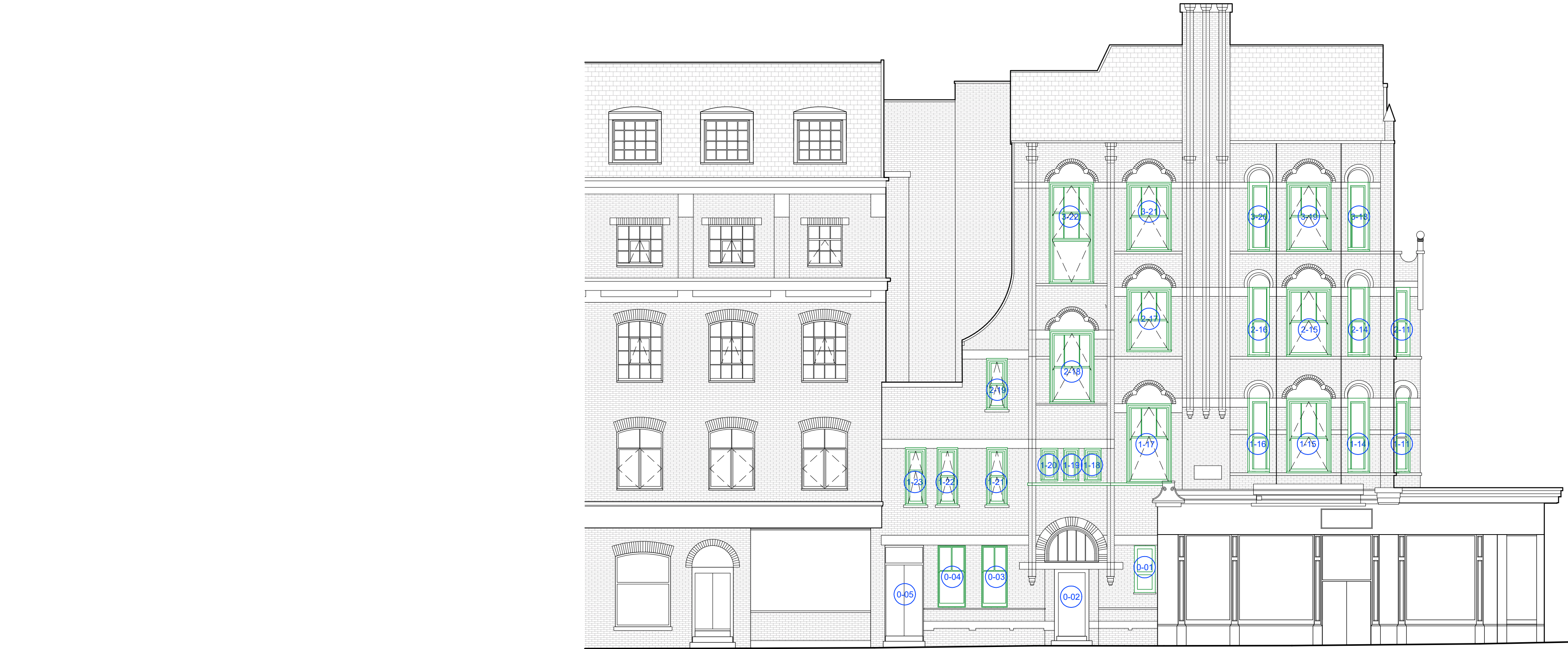
PROPOSED NORTH-WEST ELEVATION 1:100