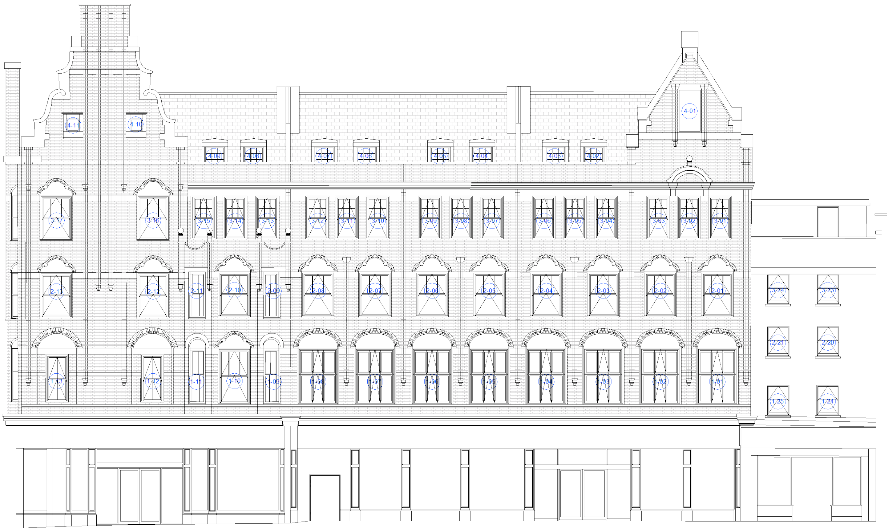
EXISTING SOUTH-WEST ELEVATION 1:100