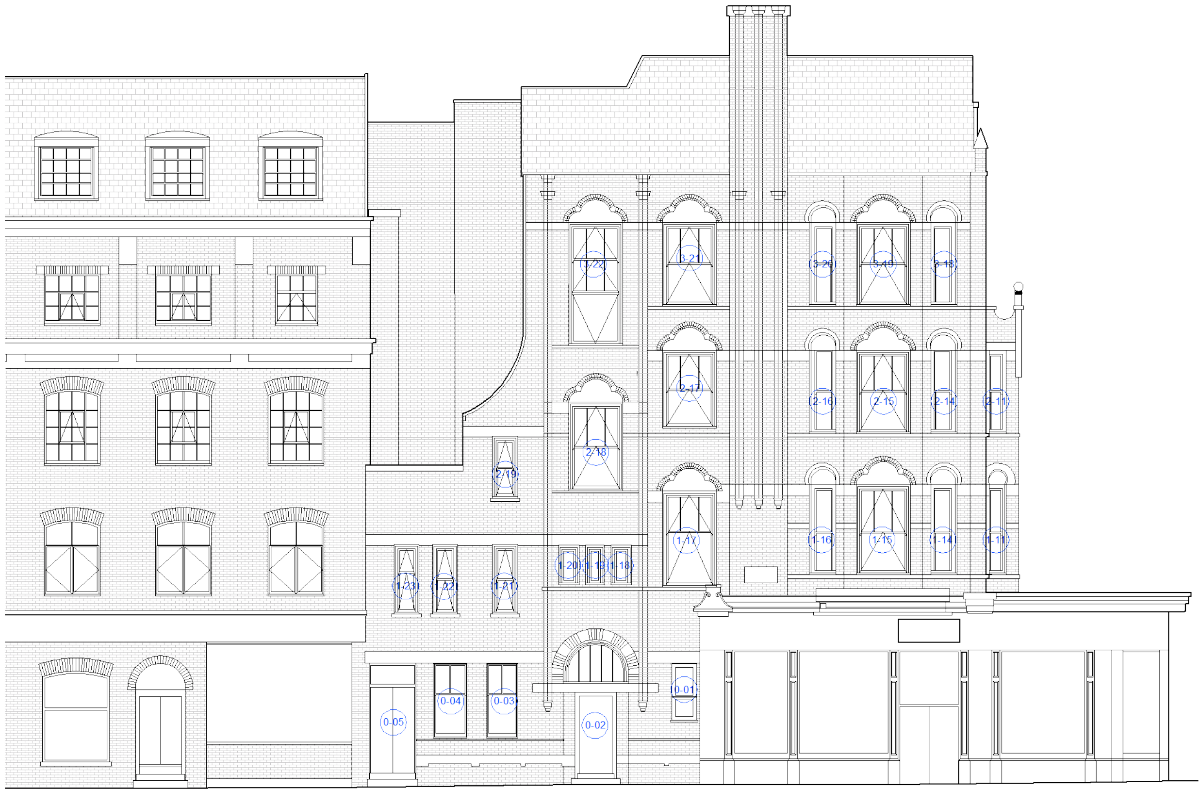
EXISTING NORTH-WEST ELEVATION 1:100

THE USE OF THIS DATA/DRAWING BY THE RECIPIENT ACTS AS AN AGREEMENT OF THE FOLLOWING STATEMENTS: IF YOU DO NOT AGREE WITH ANY OF THE FOLLOWING INFORMATION SUPPLIED TO YOU PLEASE DO NOT USE THE DATA/DRAWING AND REPORT ANY DISCREPANCIES IN WRITING TO CS2 BEFORE PROCEEDING. ALL DRAWINGS ARE BASED UPON SITE INFORMATION SUPPLIED BY THIRD PARTIES/SUB CONTRACTORS AND AS SUCH THEIR ACCURACY CANNOT BE GUARANTEED. ALL FEATURES ARE APPROXIMATE AND SUBJECT TO CLARIFICATION BY STATUTORY SERVICE ENQUIRES AND CONFIRMATION OF THE LEGAL BOUNDARIES. CHECK ALL DIMENSIONS ON SITE. DO NOT SCALE THE DRAWING. USE FIGURED DIMENSIONS IN ALL CASES. ALL DIMENSIONS TO BE IN METRIC STANDARDS UNLESS STATED OTHERWISE.