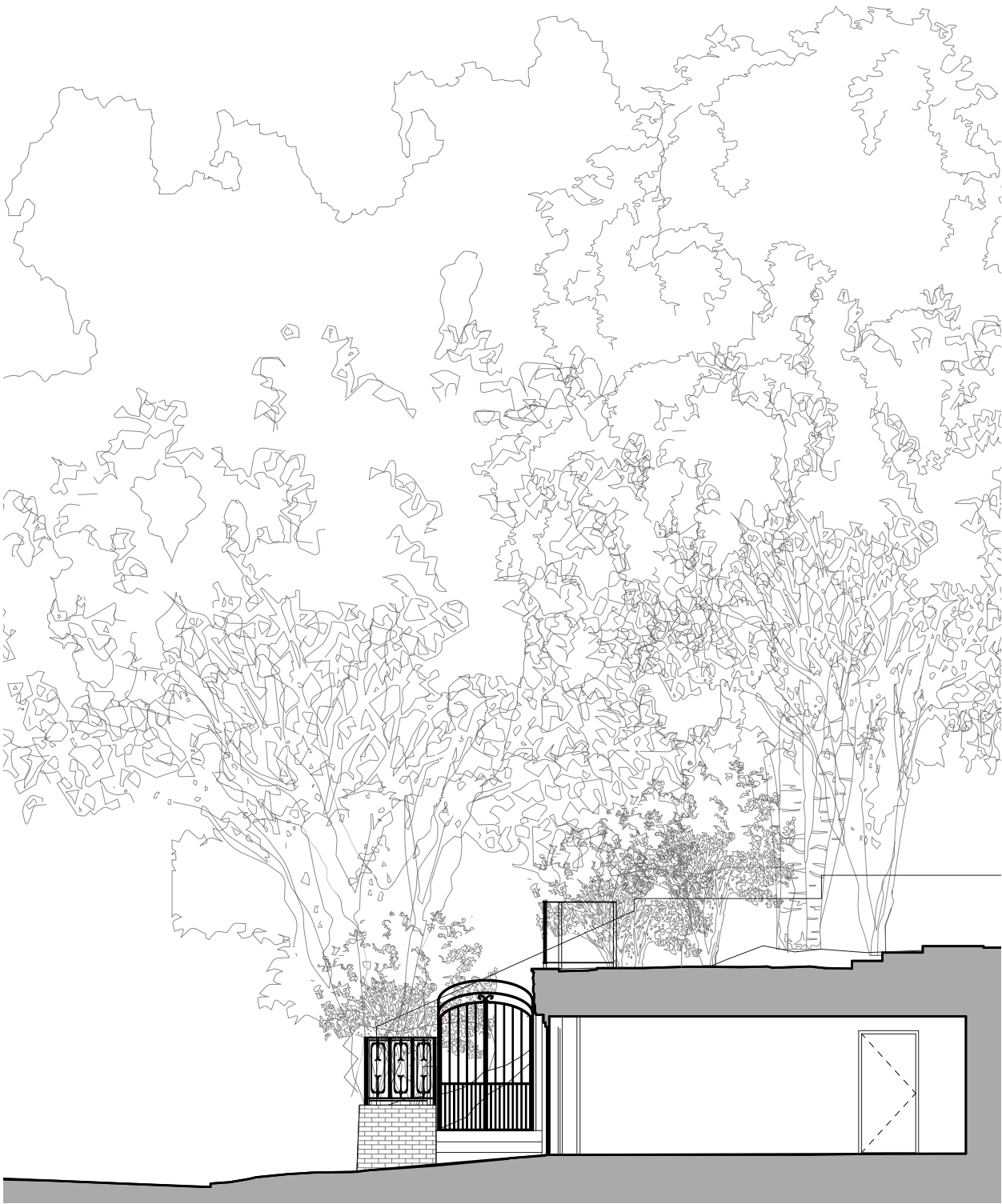
Redington Rd 20 Redington Rd