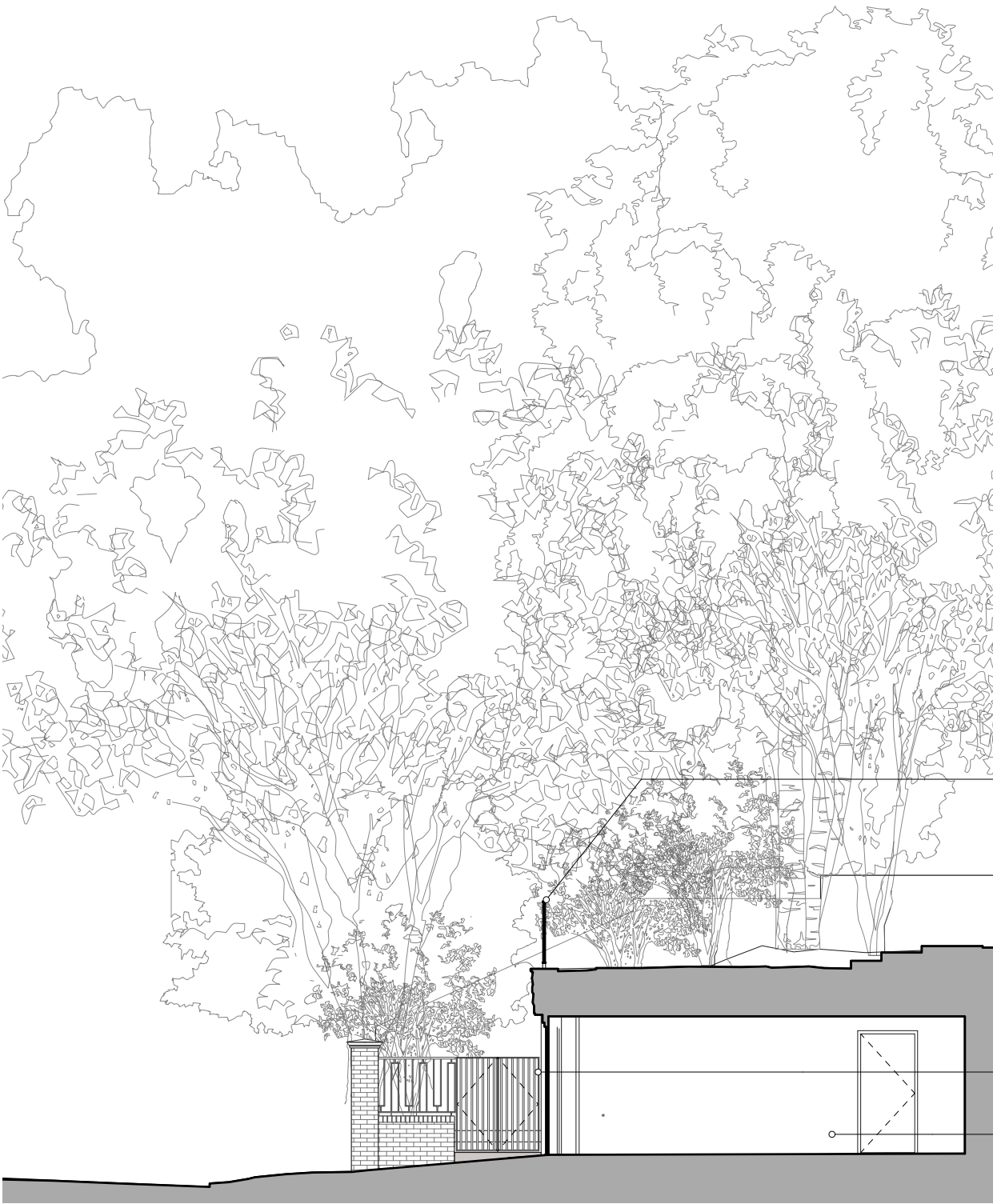
Redington Rd 20 Redington Rd