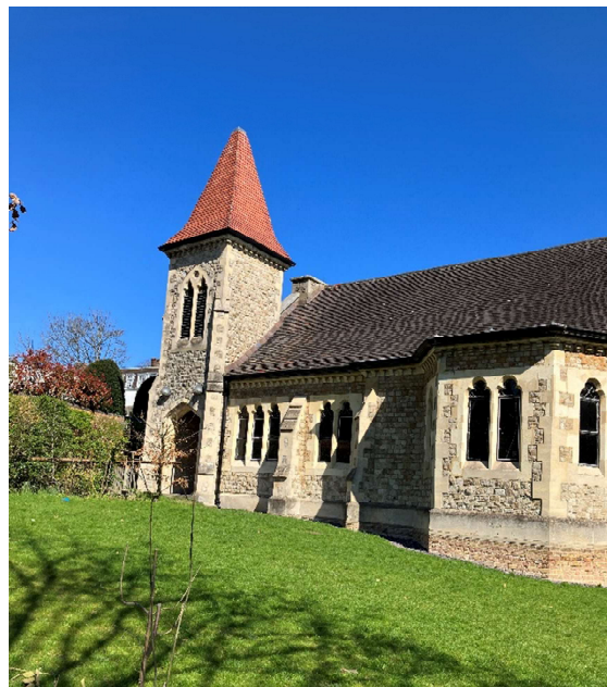
Figure 2: Main building overview

The works proposed are 2no. replacement timber door sets located to the main building as shown in figure 2 above. The doorsets are a security concern for the school as they have undergone numerous poorly conducted repairs over time which has led to the doors becoming beyond repair and with the locking mechanisms ineffective.