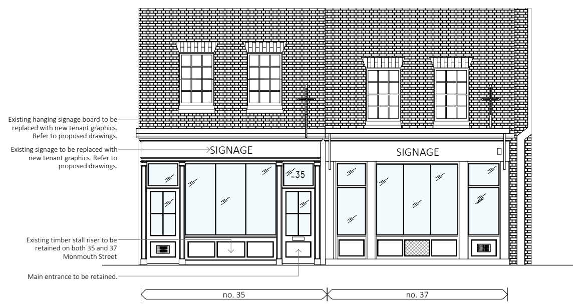
Existing Front Elevation 1:100