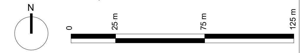
1 Site Plan Showing 1st and 3rd floor external terrace plans Plan Scale: 1 : 500

Project Stephen Street Ground Floor Studios Drawing title Planning Site Plan Showing 1st and 3rd floor external terrace plans Plan Scale@A1 1 : 500 Drawing Number SS0 - ORM - ZZ - ZZ - DR - A - 12001 Project Originator Zone Location Type Role Number SS0 - ORM - ZZ - ZZ - DR - A - 12001 P03