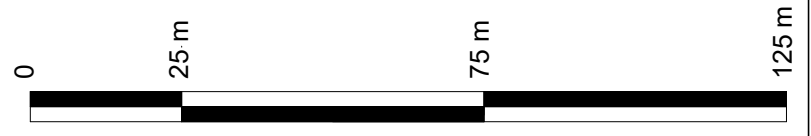
1 Location Plan Showing 1st and 3rd floor external terrace plans Scale:1 : 1250