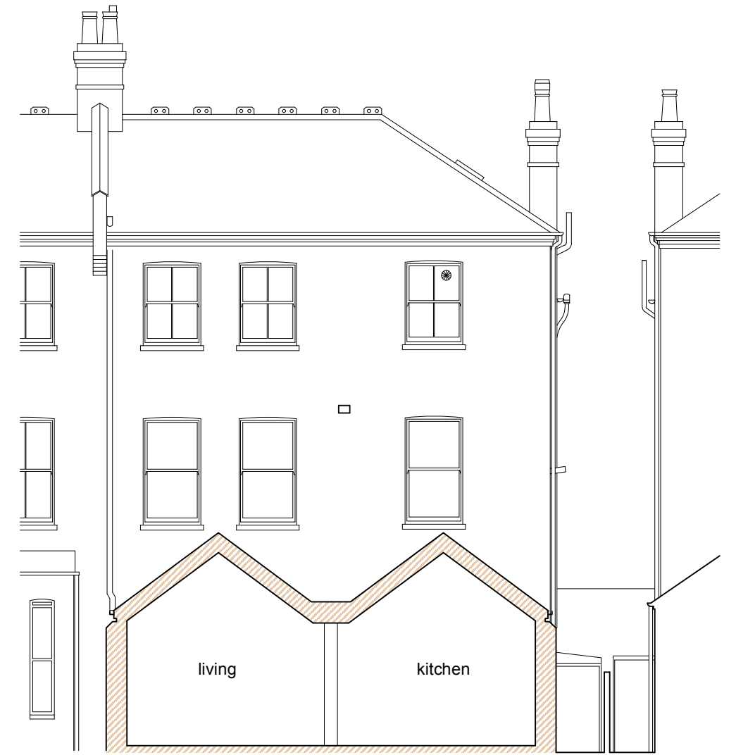
PROPOSED SECTION B-B