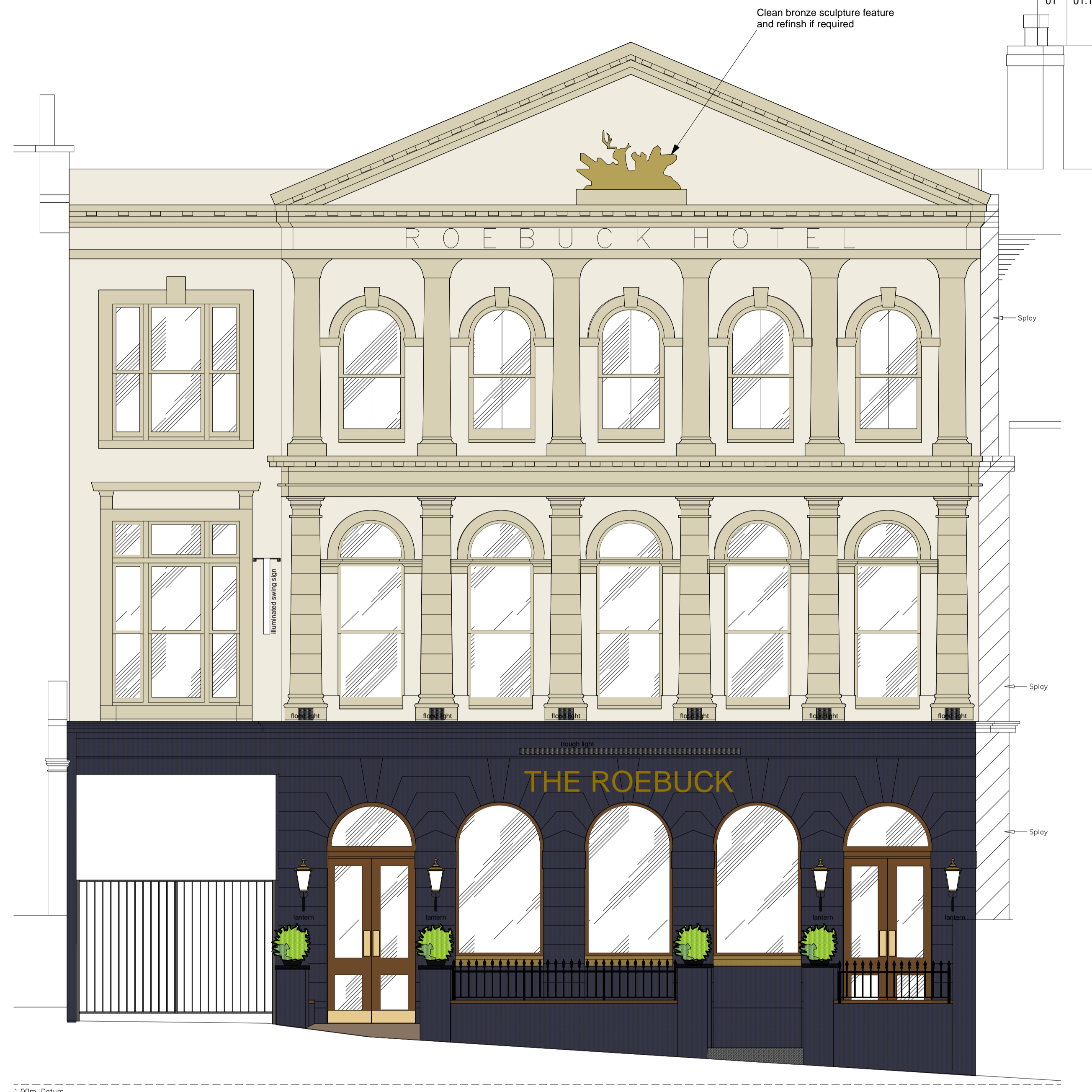
B PROPOSED FRONT ELEVATION Scale: 1:50