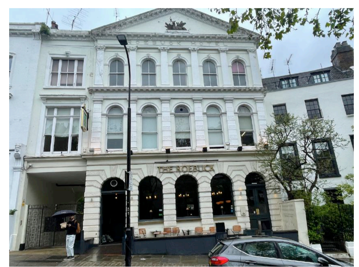
C EXISTING EXTERIOR