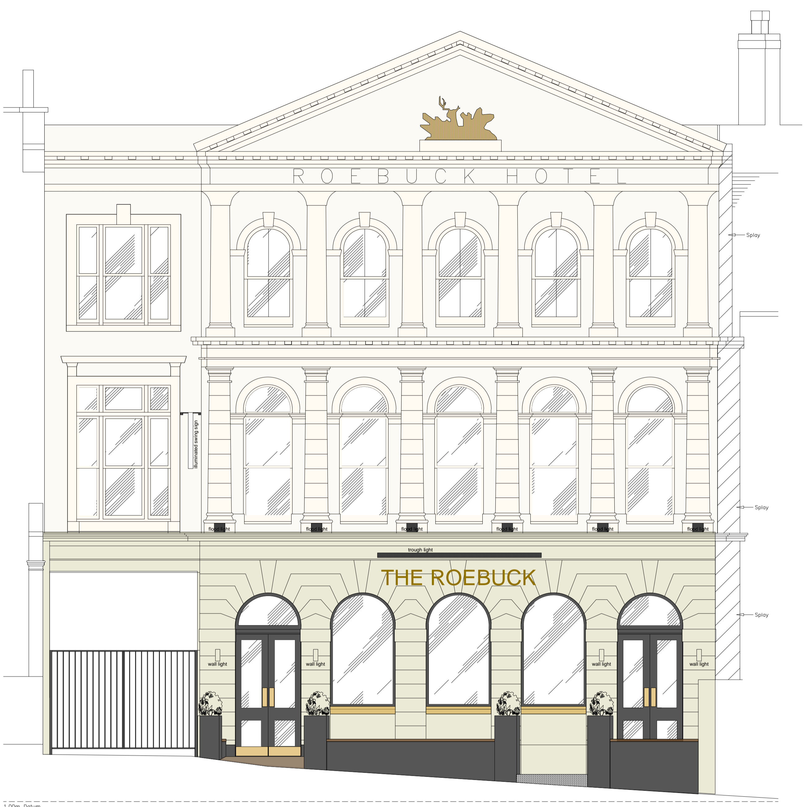
A EXISTING FRONT ELEVATION Scale: 1:50