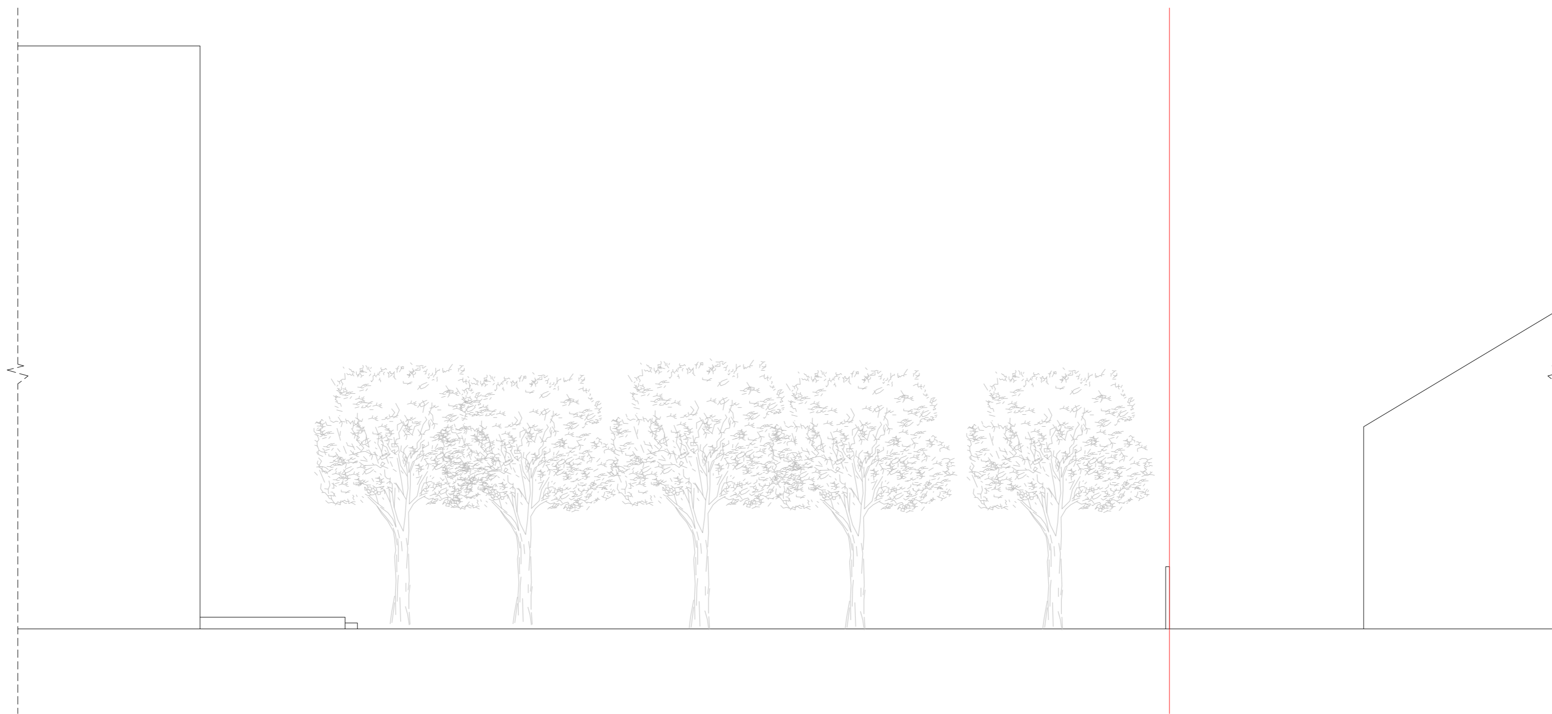
Existing A-A Section

Any dimensions shown should be checked on site and discrepancies reported to the Architect prior to construction. Designs are not coordinated with engineer projects. Do not scale for construction purposes.