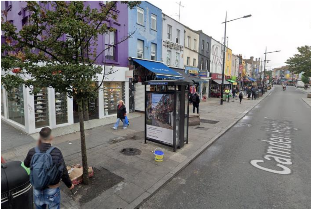
Figure One: Existing and proposed location of telephone kiosk, centre

telephone kiosk close to the site at 221 Camden High Street (see Figure One). No permission, nor prior approval was granted for the existing kiosk.