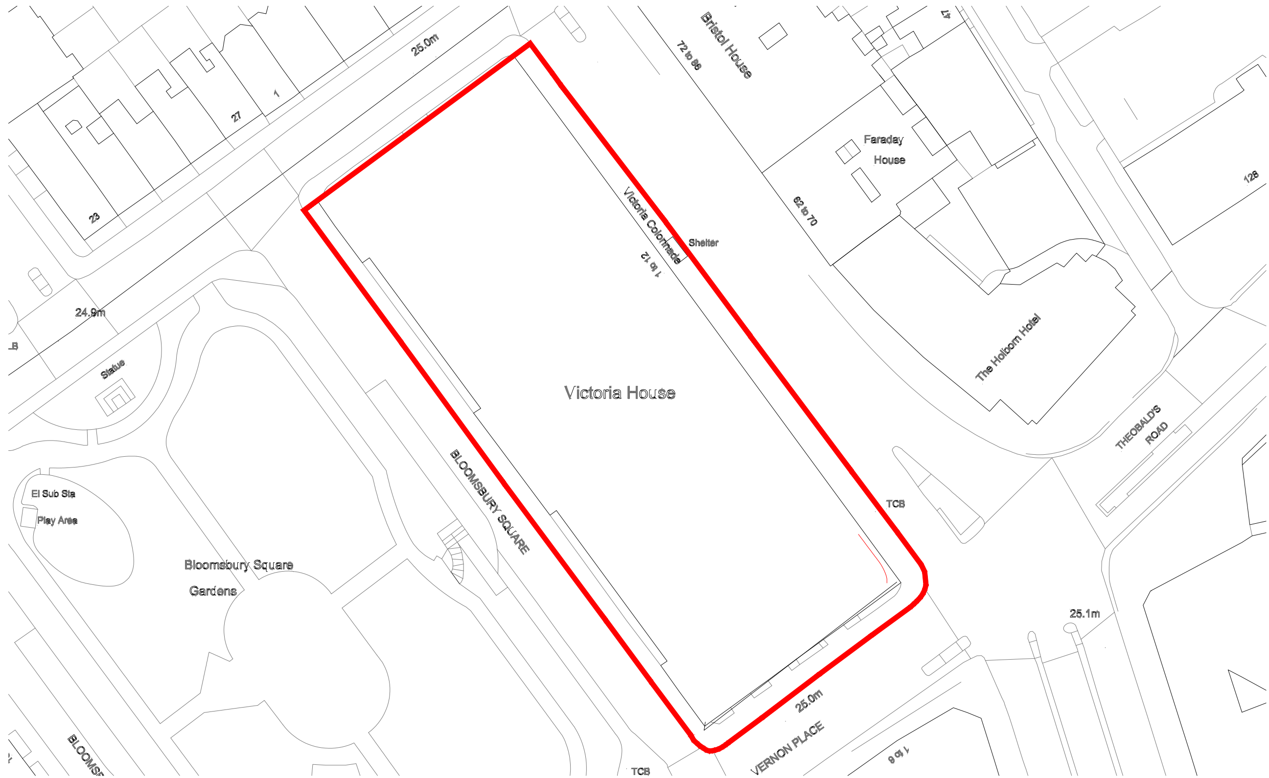
1 BLOCK PLAN 1:500