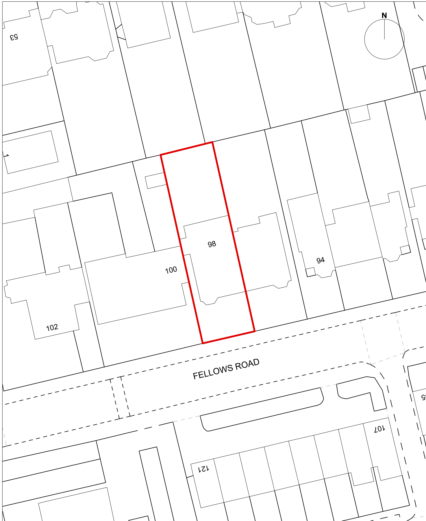
1 Block Plan Scale 1:500