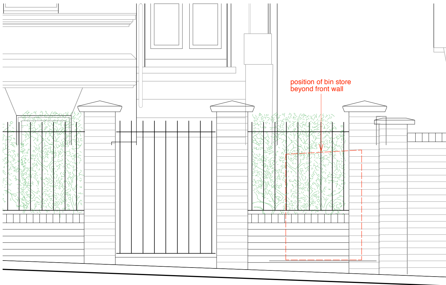
FRONT WALL ELEVATION 1:25