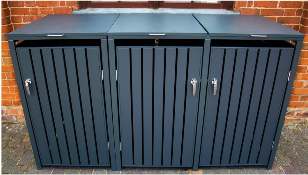
Fig 1. Front elevation of proposed (triple) anthracite galvanised steel bin store (closed)