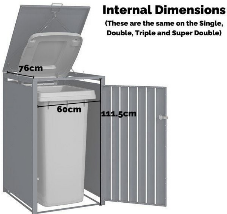
Fig 4. Proposed bin store (internal) dimensions per compartment