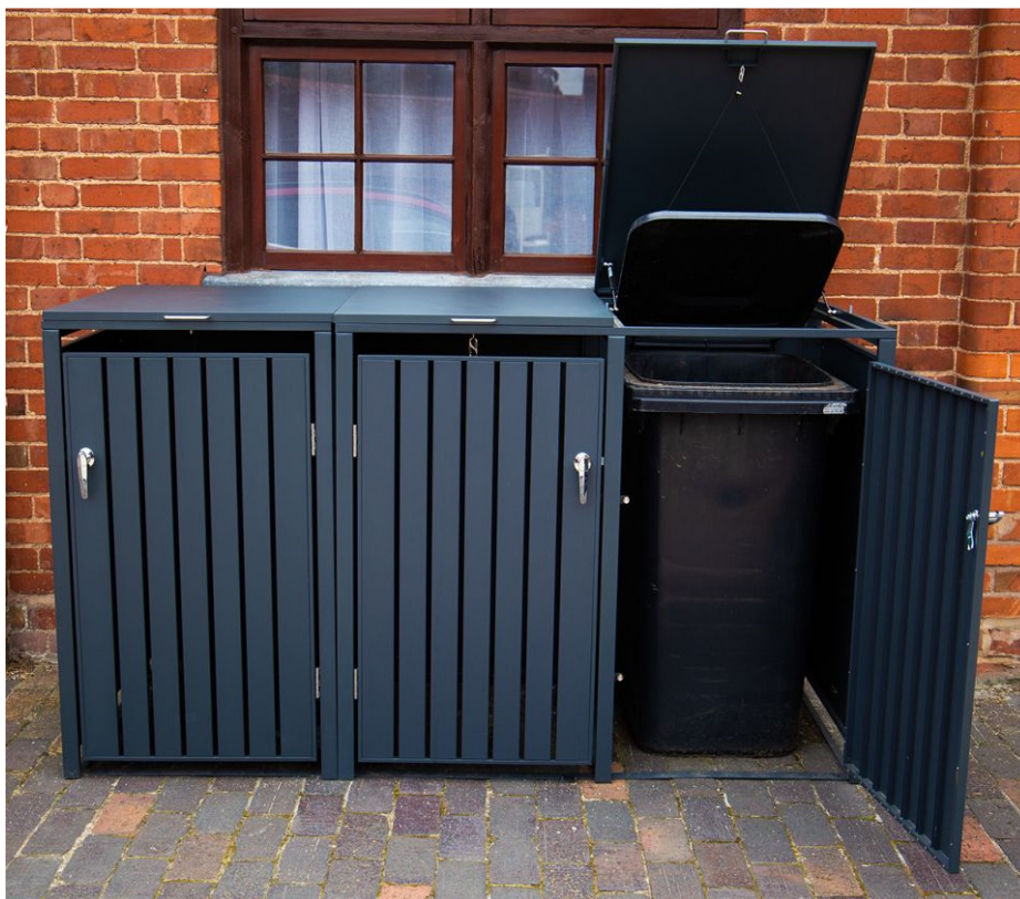
Fig 2. Front elevation of proposed (triple) anthracite galvanised steel bin store (opened)