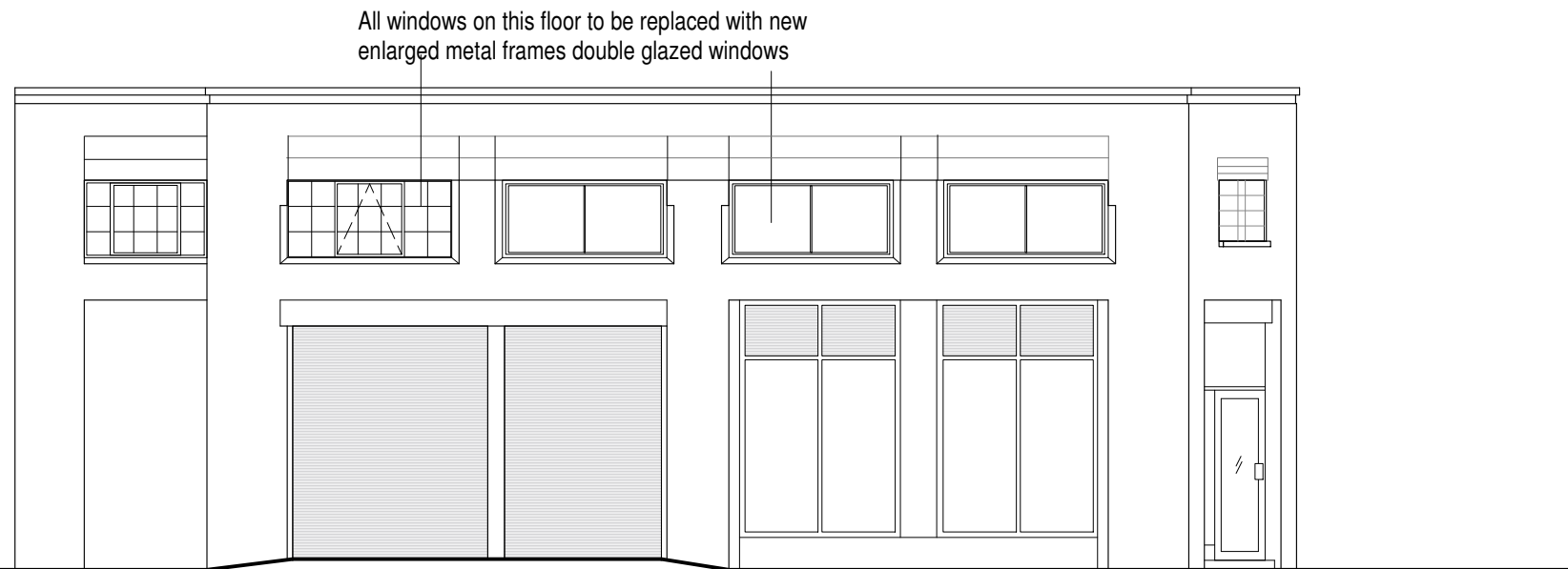
EXISTING WARREN STREET ELEVATION (SOUTH)