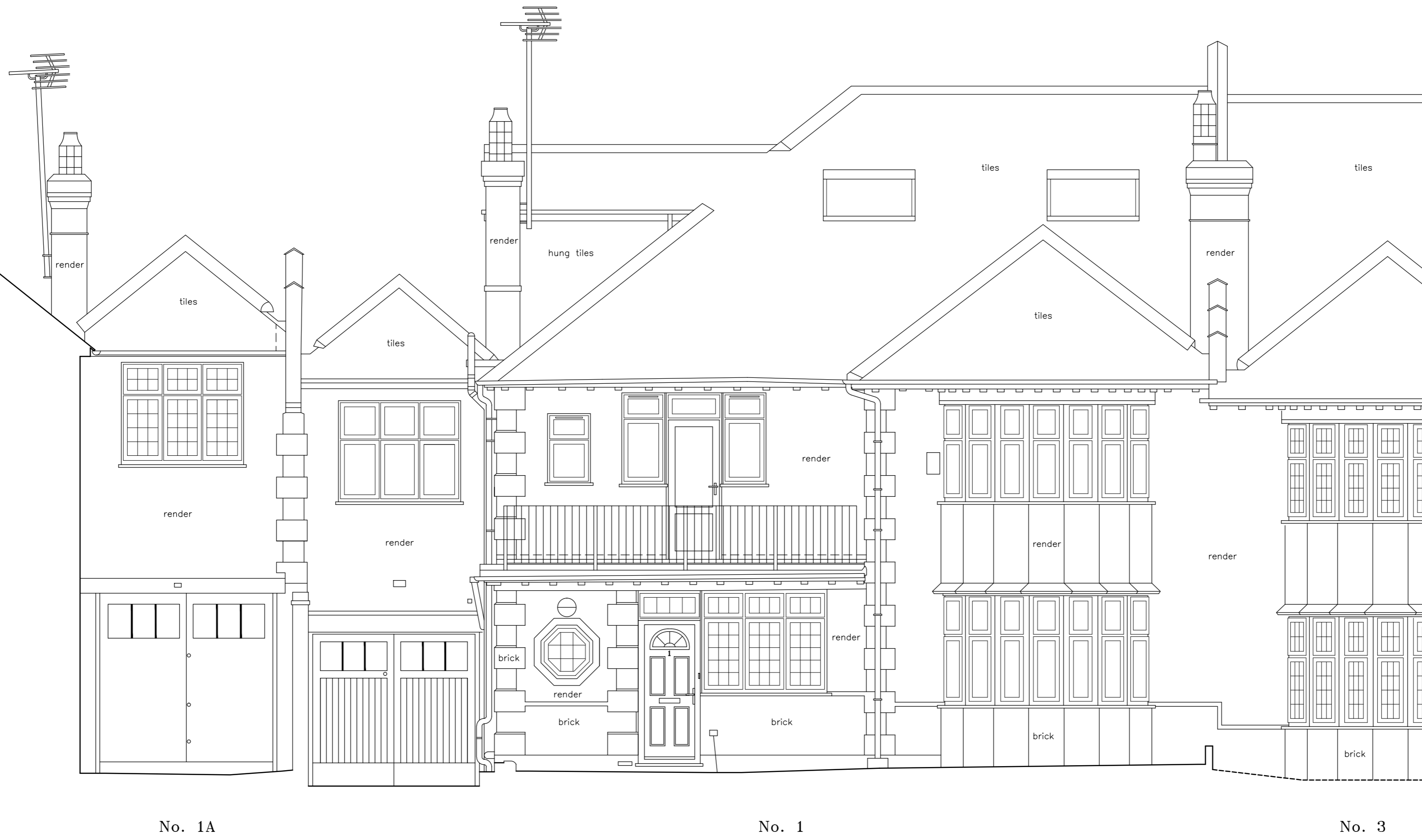
NORTH EAST ELEVATION 60.00m A.O.D.