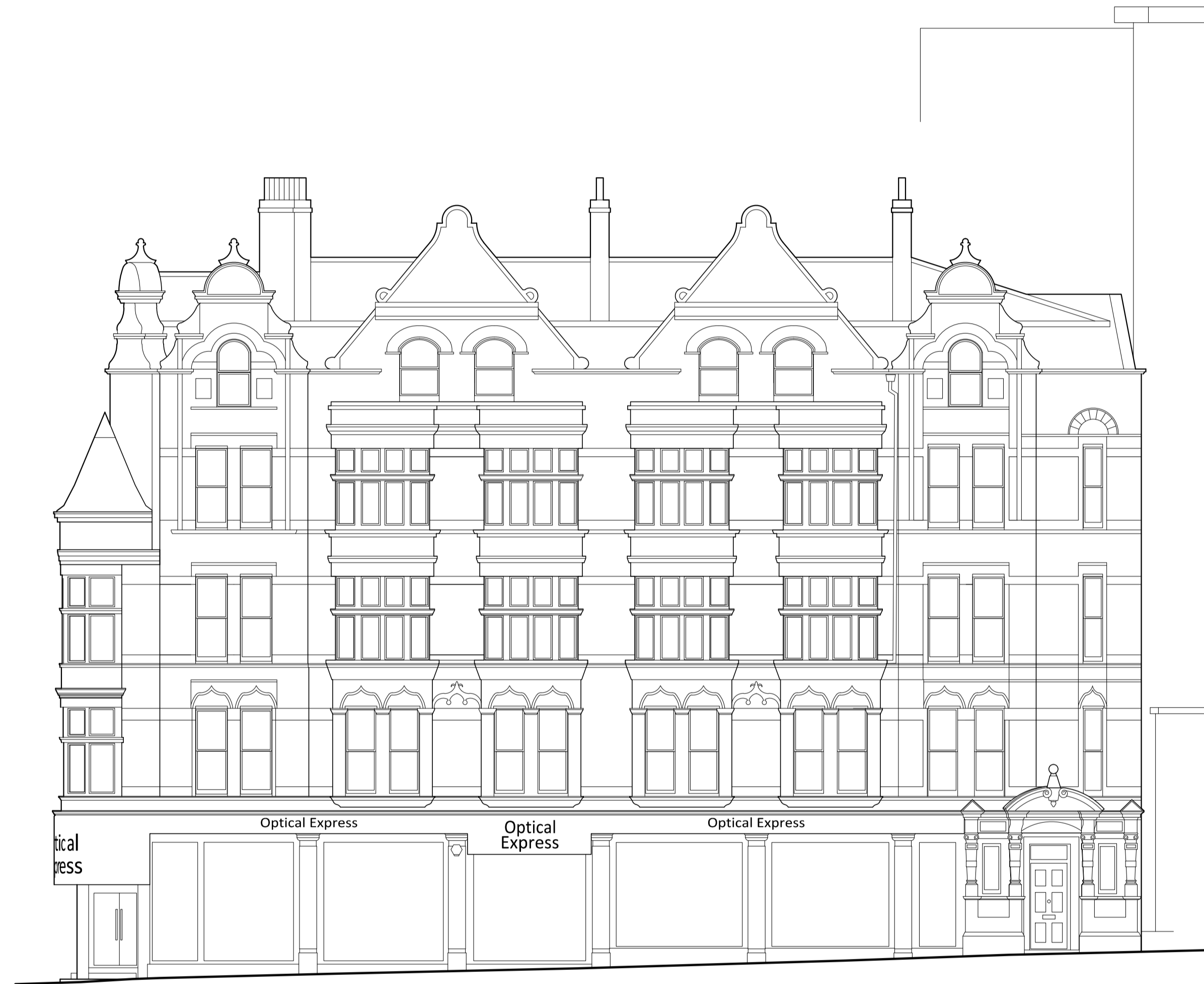
2 Existing Elevation 1:100 Shaftesbury Avenue