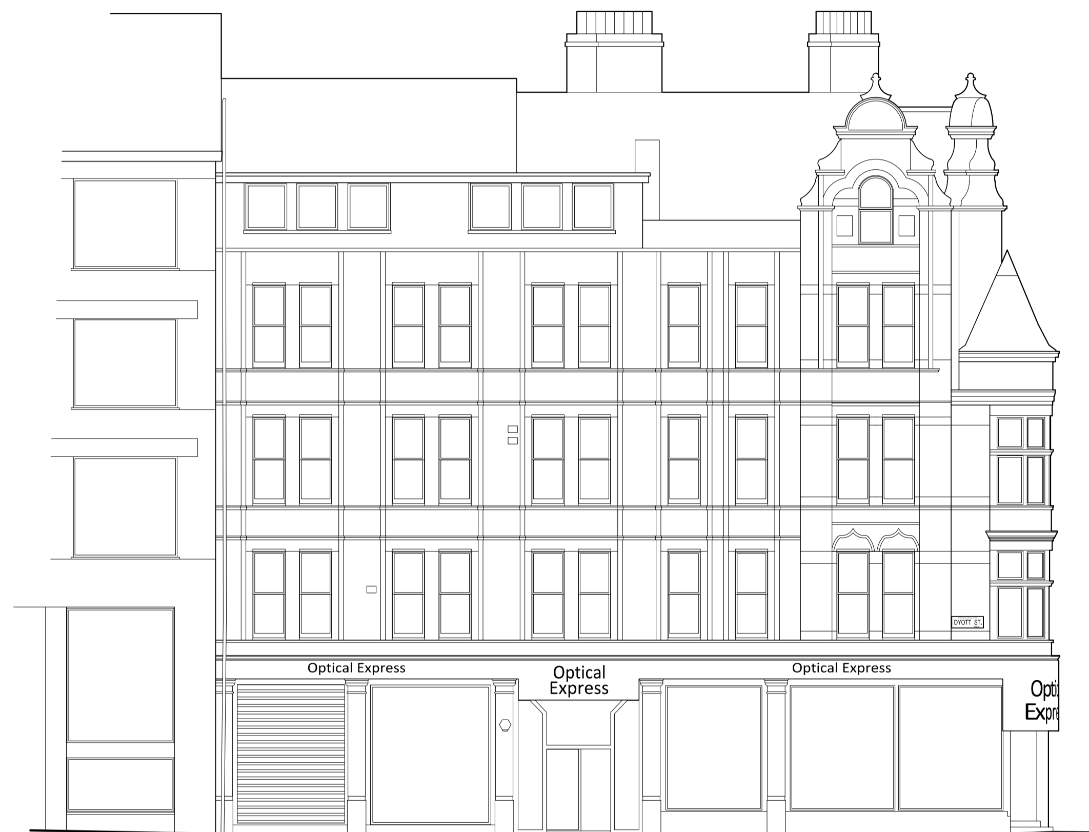
1 Existing Elevation 1:100 Dyott Street