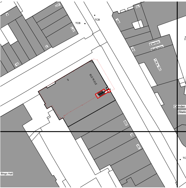
Existing Location 1:1250