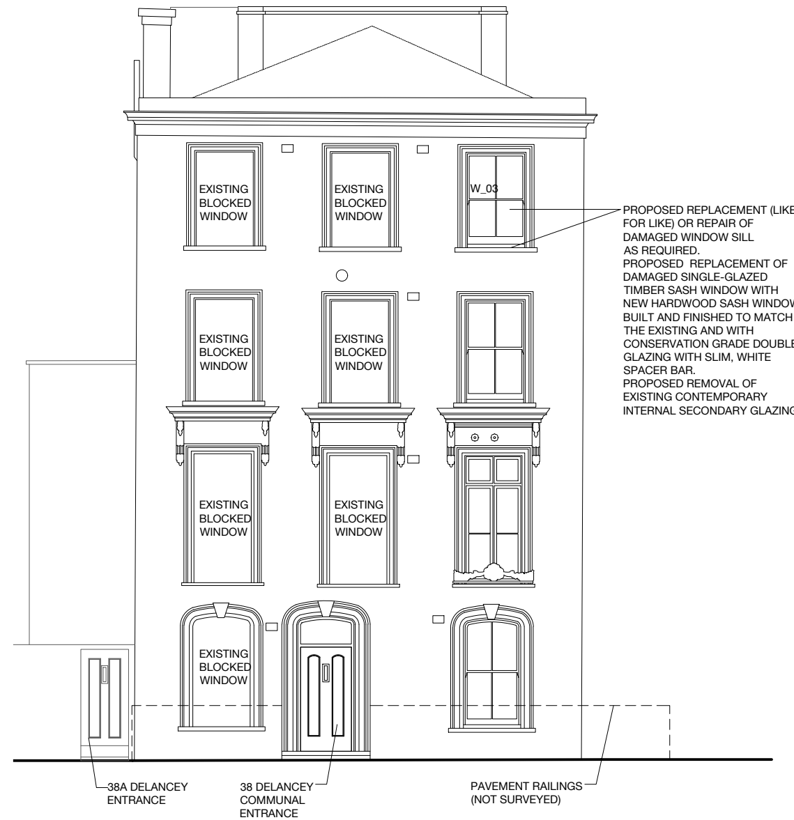
01 PROPOSED SOUTH-WEST ELEVATION 22-02 SCALE 1:100