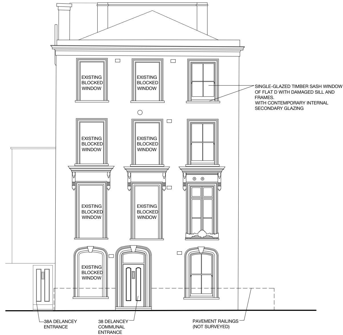
01 EXISTING SOUTH-WEST ELEVATION 00B-02 SCALE 1:100