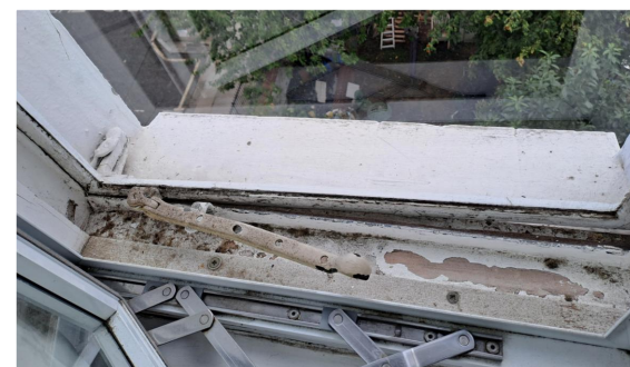
PHOTOGRAPH OF EXISTING SINGLE-GLAZED METAL WINDOWS IN BEDROOM WITH SEVERELY DAMAGED FRAMES AND CONTEMPORARY INTERNAL SECONDARY GLAZING