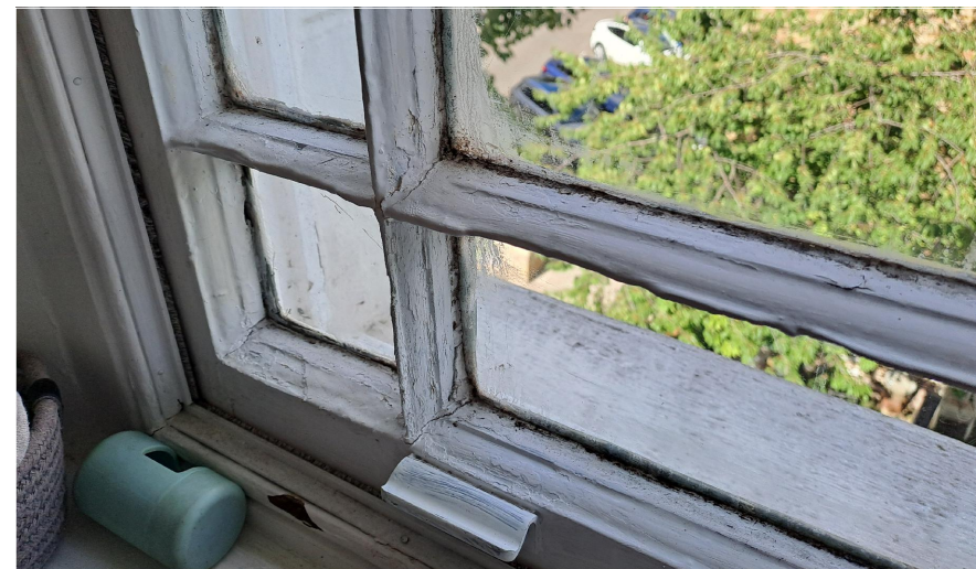
PHOTOGRAPH OF EXISTING SINGLE-GLAZED SASH WINDOWS ON STAIR LANDING IN BAD CONDITION AND WITHOUT SECONDARY GLAZING.