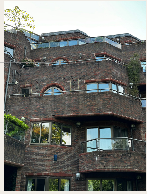
Photomontage of proposed North Elevation Flat F