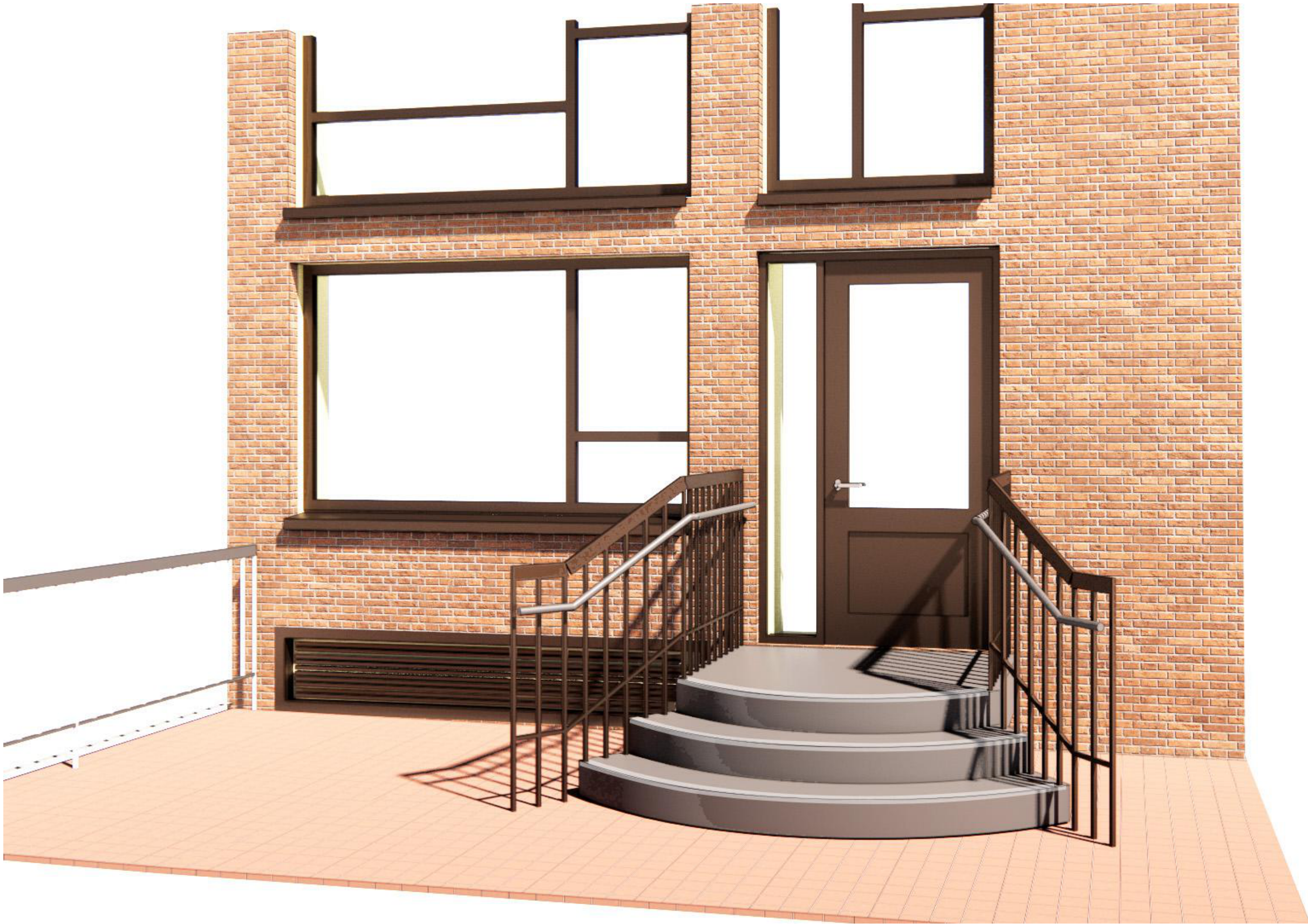
3D VISUAL - TRA DOOR ARRANGEMENT