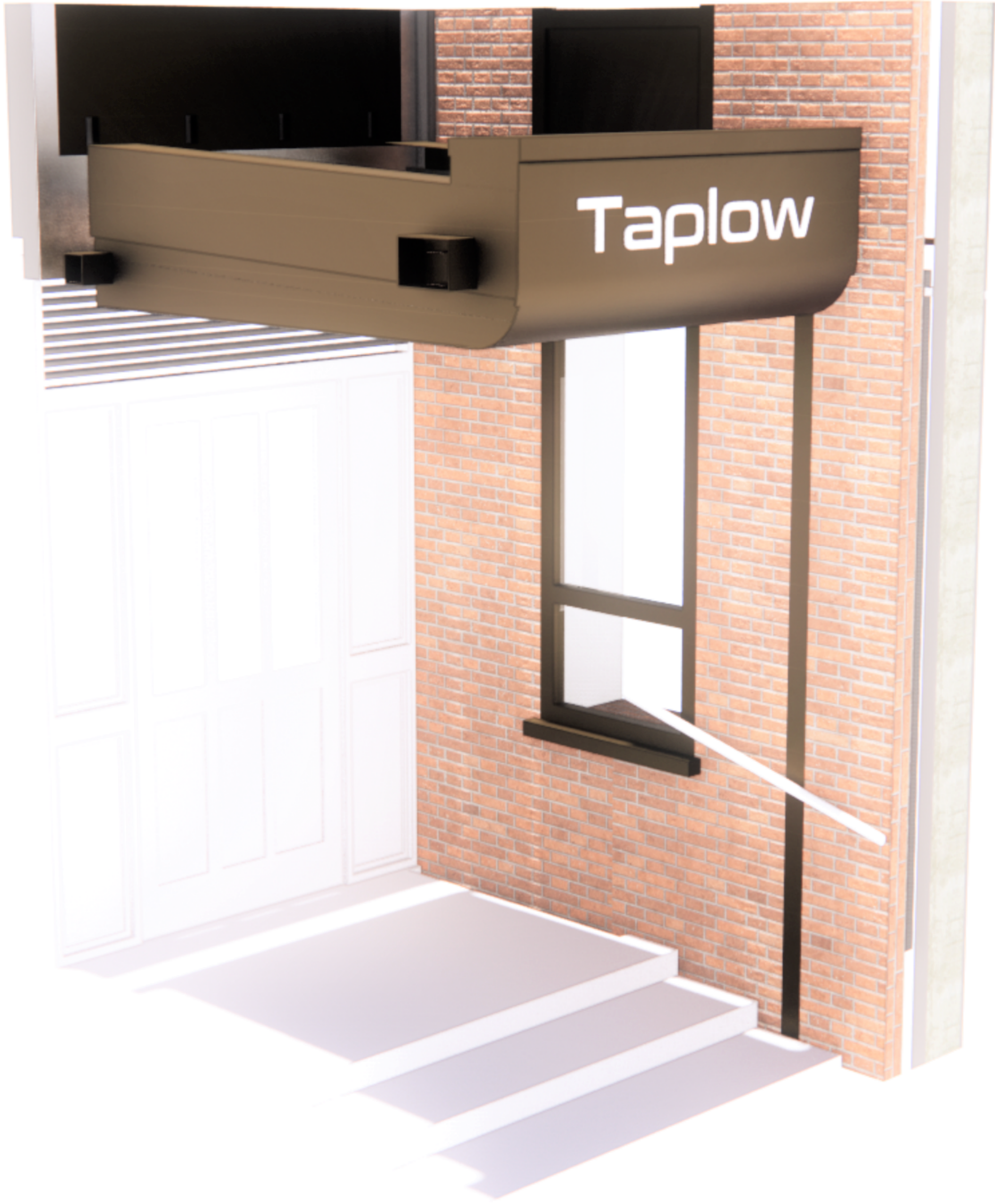
3D VISUAL - TYPICAL CANOPY ARRANGEMENT