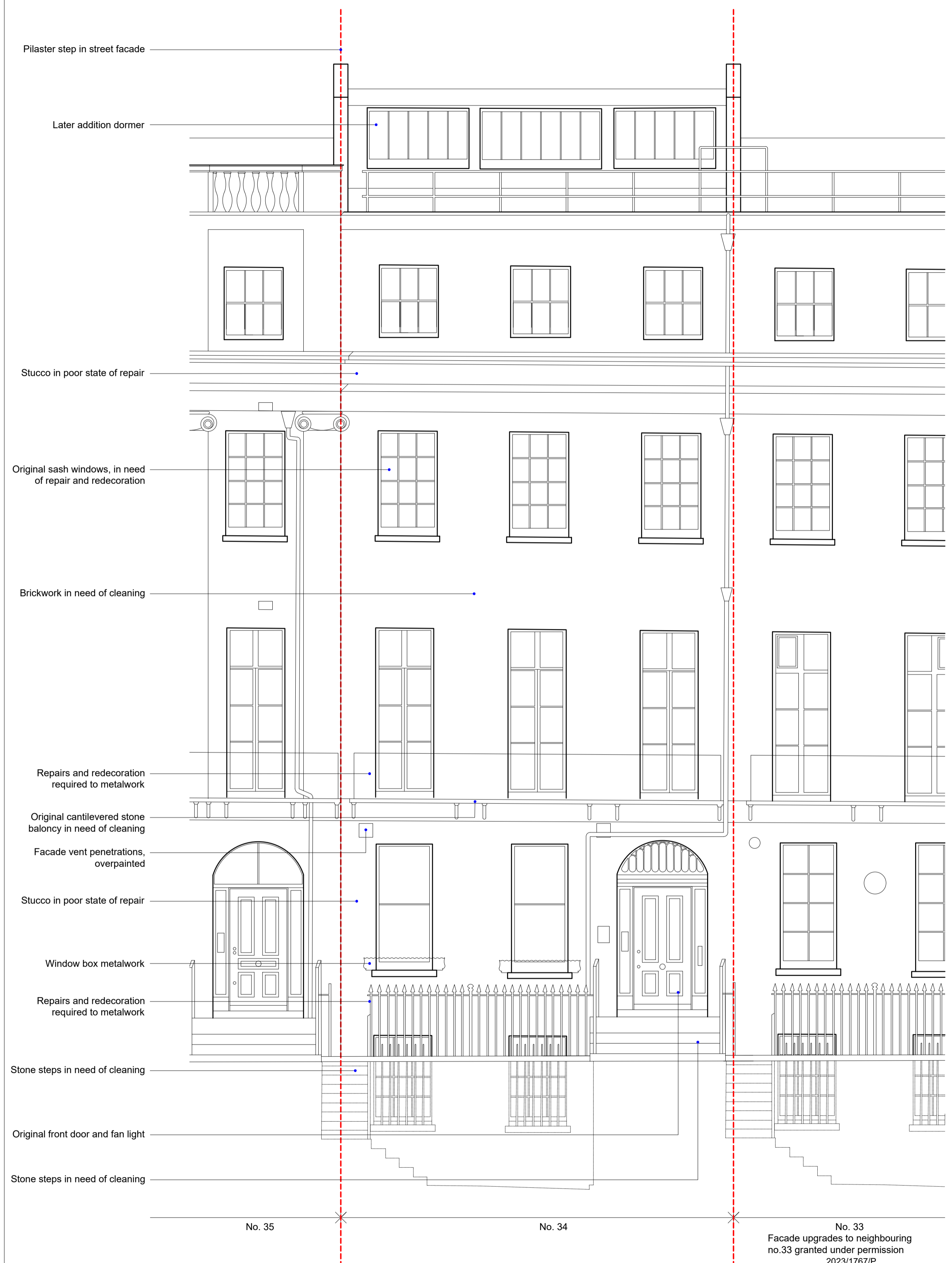
1 / Existing East Elevation 1:50

DO NOT SCALE THE CONTRACTOR IS TO CHECK AND VERIFY ALL BUILDING AND SITE DIMENSIONS, LEVELS AND SEWER INVERT LEVELS AT CONNECTION POINTS BEFORE WORK STARTS. THIS DRAWING IS TO BE READ AND CHECKED IN CONJUNCTION WITH ENGINEERS AND OTHER SPECIALIST DRAWINGS. THE DRAWING AND THE WORKS DEPICTED ARE THE COPYRIGHT OF HAWORTH TOMPKINS LTD AND MAY NOT BE REPRODUCED EXCEPT BY WRITTEN PERMISSION.