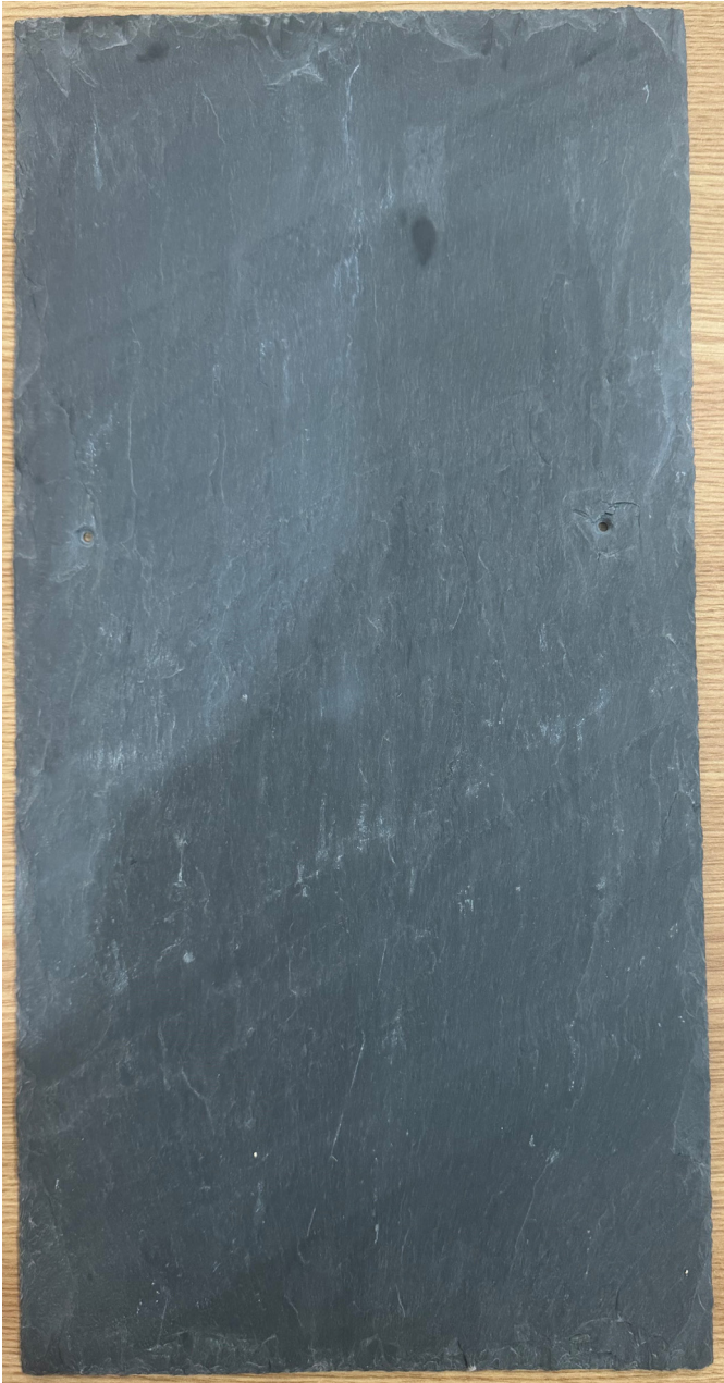
PROPOSED ROOF SLATE