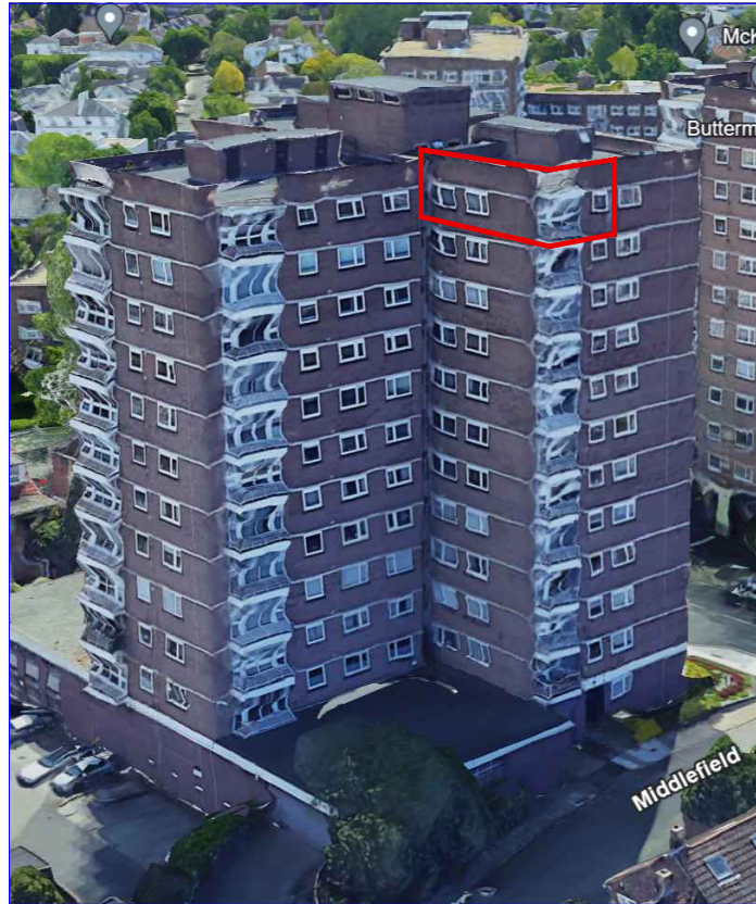
01 - BLAIR COURT VIEW 01 INDICATING FLAT 78 LOCATION