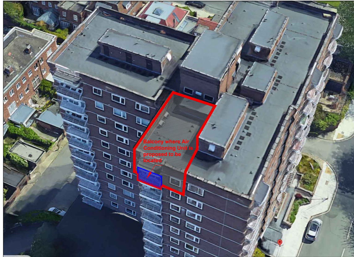
02 - BLAIR COURT VIEW 02 INDICATING FLAT 78 LOCATION