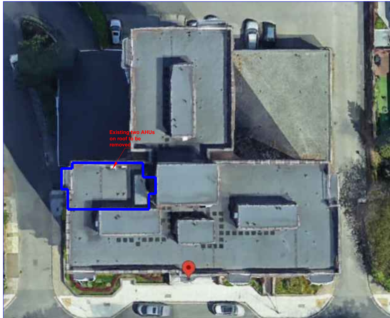
03 - BLAIR COURT ROOF SHOWING EXISTING PLANT